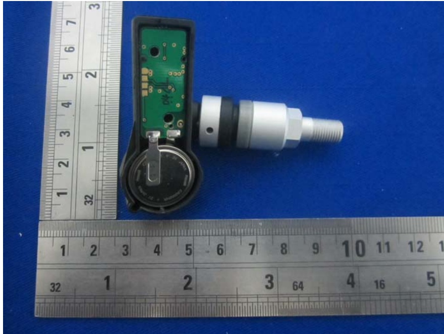
EUT – Cover off View