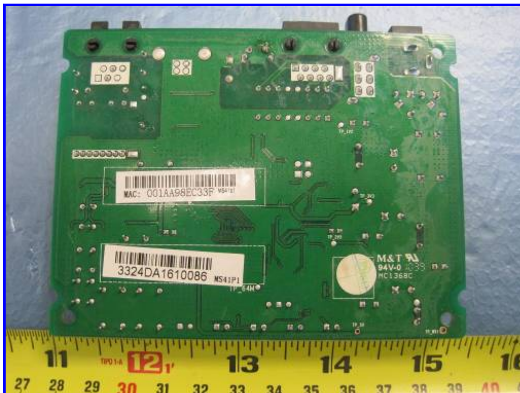
Rear View of mainboard PCB