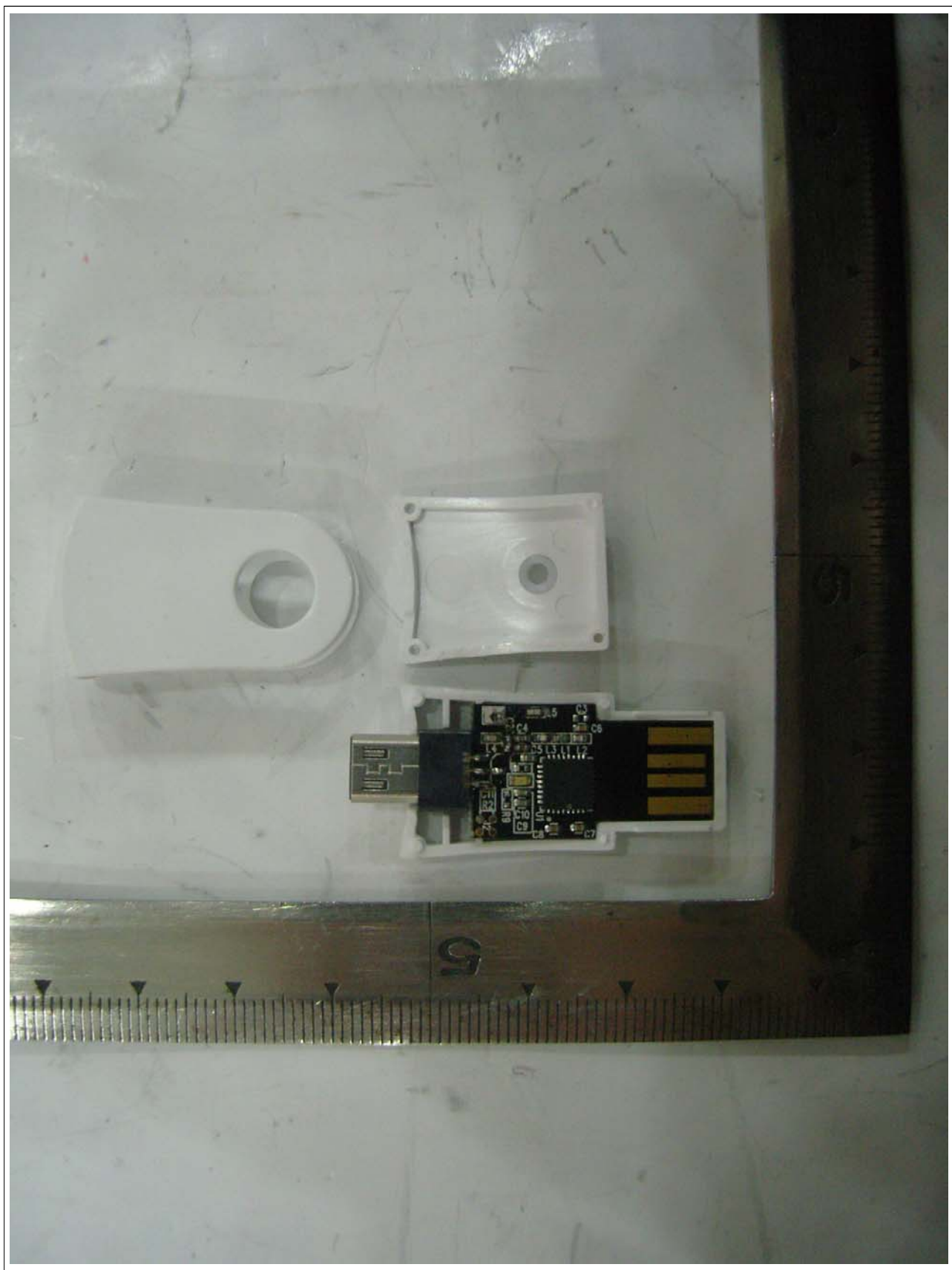
Interior view of EUT