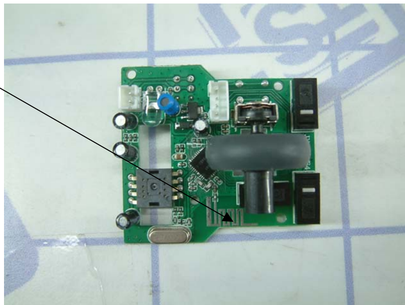
Transmitter PCB1 Layout

Copyright of this report is owned by Centre of Testing Service and may not be reproduced other than in full except with the written approval of the issuing Company.