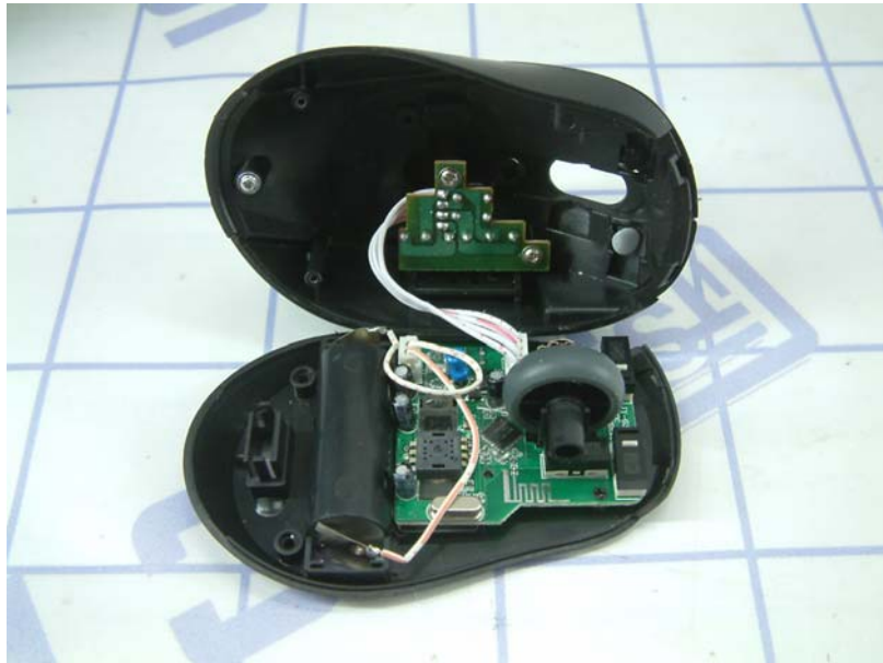
Transmitter Internal view