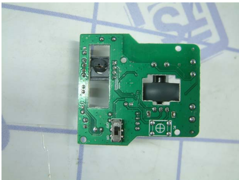
Transmitter PCB1 Solder