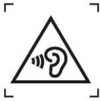
Figure 1 – Warning label (IEC 60417-6044)

To prevent possible hearing damage, do not listen at high volume levels for long periods.