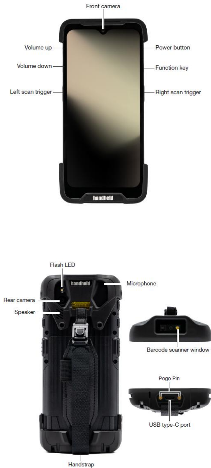
Nautiz X21 Product View.