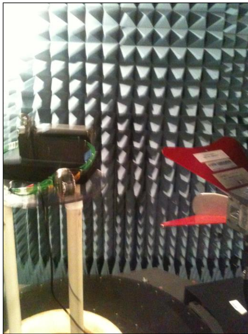
Photograph 4. Radiated Spurious Emissions, Test Setup, 1 GHz – 18 GHz