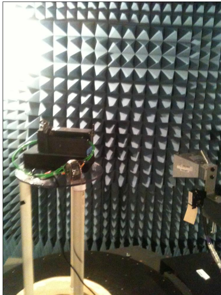
Photograph 4. Radiated Spurious Emissions, Test Setup, 18 GHz – 26 GHz