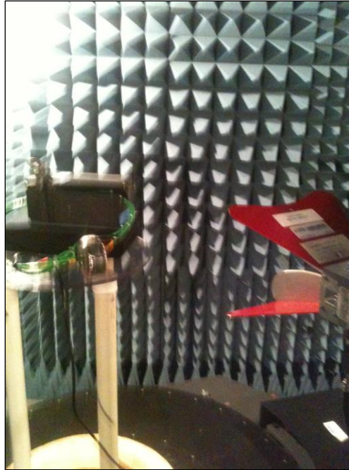
Photograph 3. Radiated Spurious Emissions, Test Setup, 1 GHz – 18 GHz