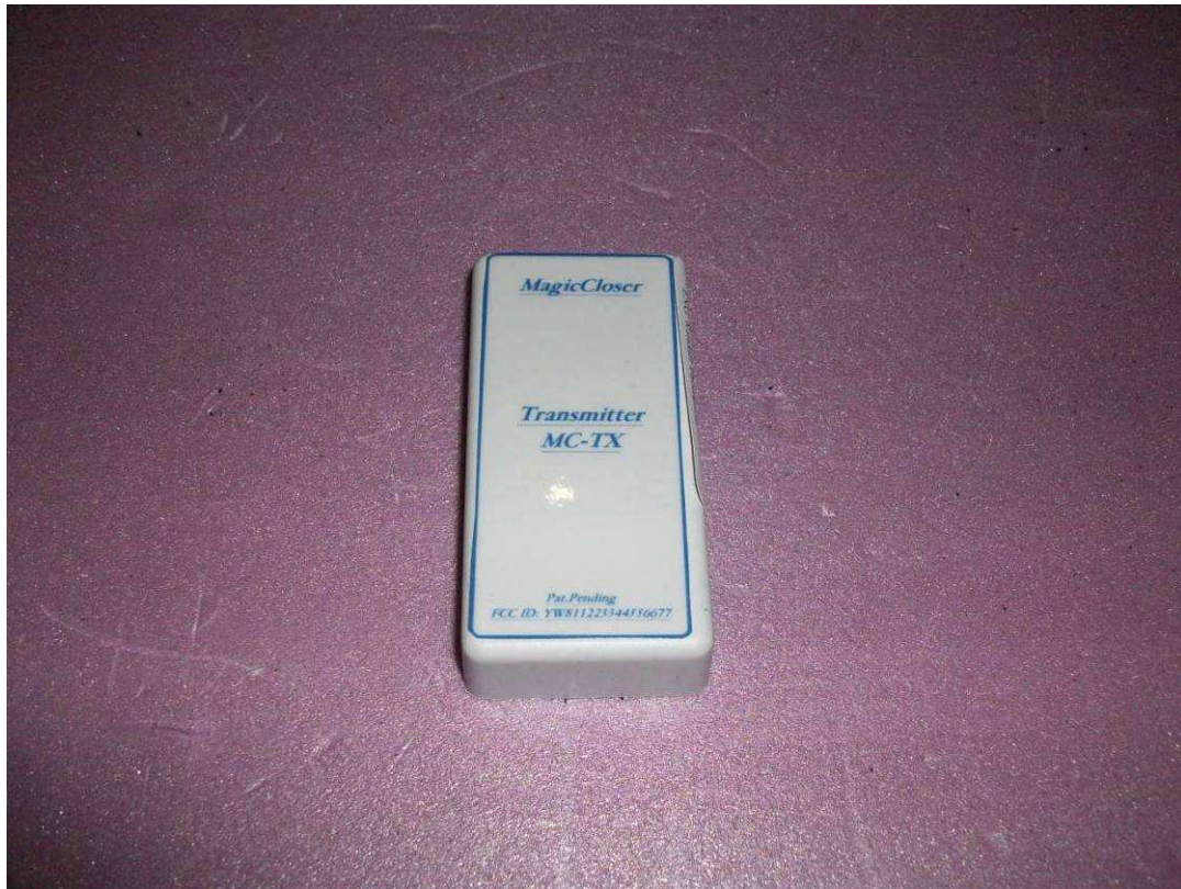
Worst-Case Axis 1 (EUT Flat on Table)