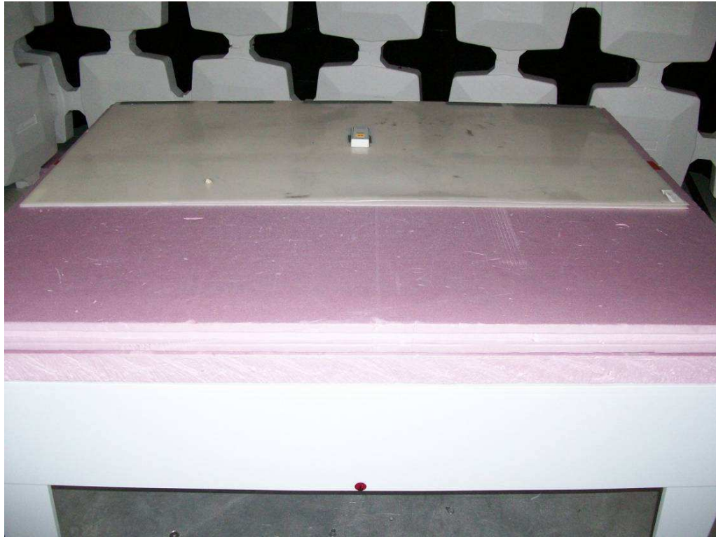
Test setup – Front View