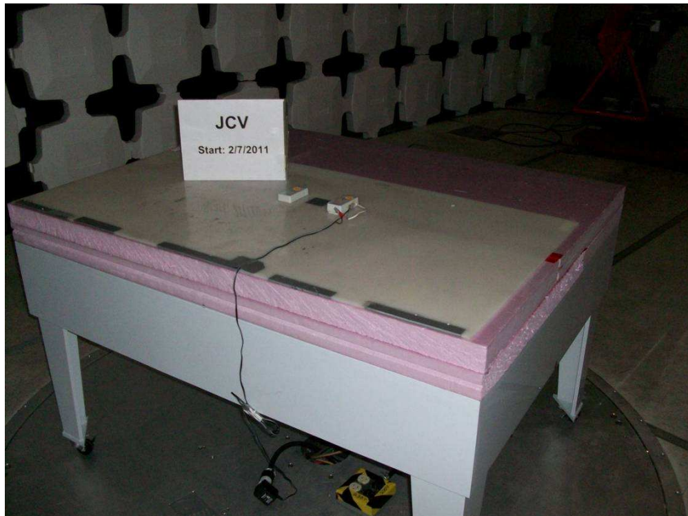
Test setup – Rear View