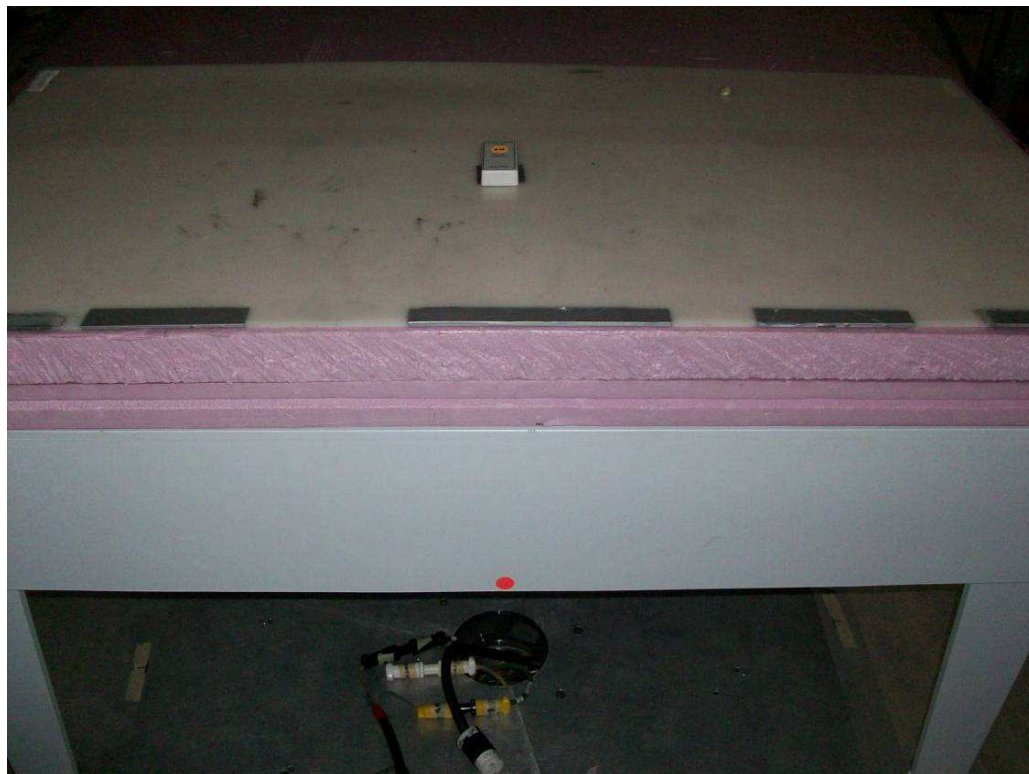
Test setup – Rear View