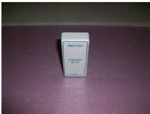
Axis 2 (EUT Vertical)