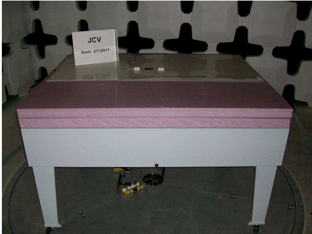
Test setup – Front View