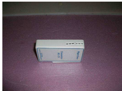
Axis 3 (EUT Vertical & Rotated 90 degrees)