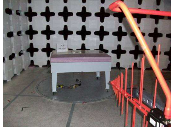
BiLog (30MHz to 1000MHz)