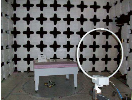
Active Loop (9kHz to 30MHz)