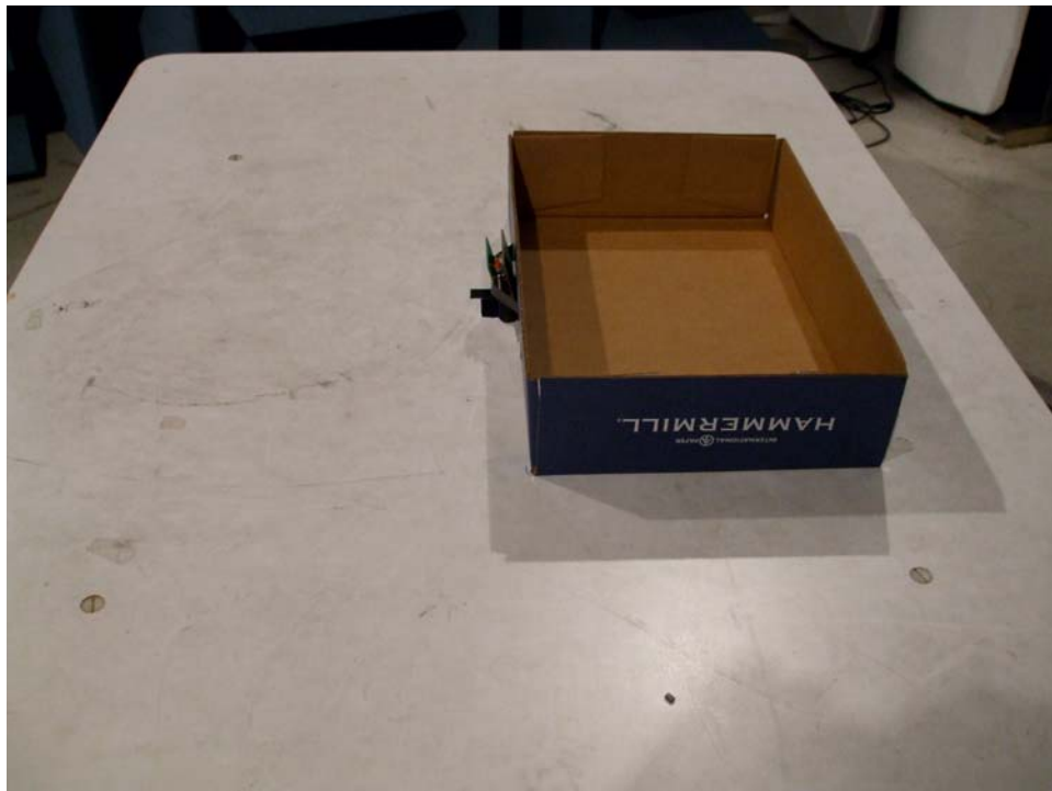
RADIATED EMISSIONS TEST CONFIGURATION WS4TX 5m SEMIANECHOIC CHAMBER LEXMARK INTERNATIONAL, LEXINGTON KY