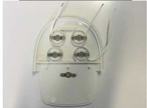
View of inside back case