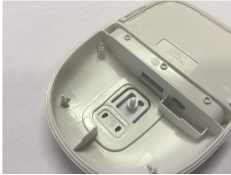
View of inside of top case