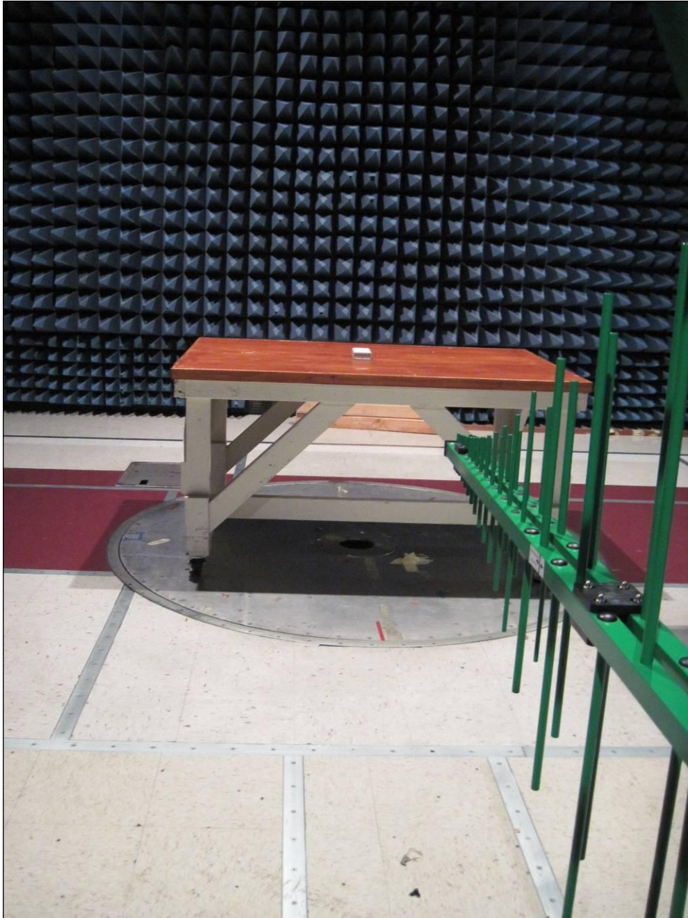
Photograph 1. Radiated Emission, Test Setup