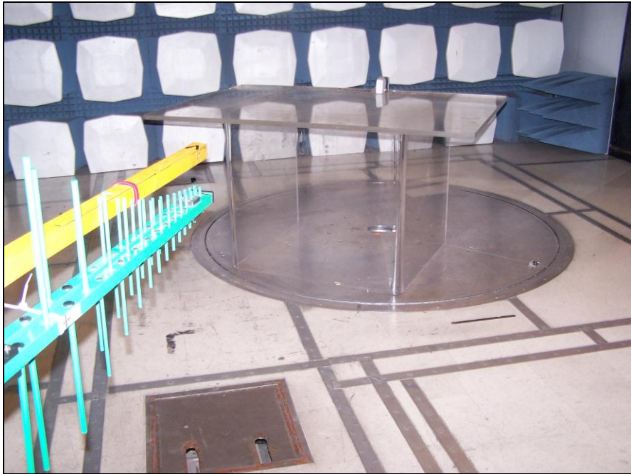
Photograph 3. Radiated Spurious Emissions, Test Setup 2