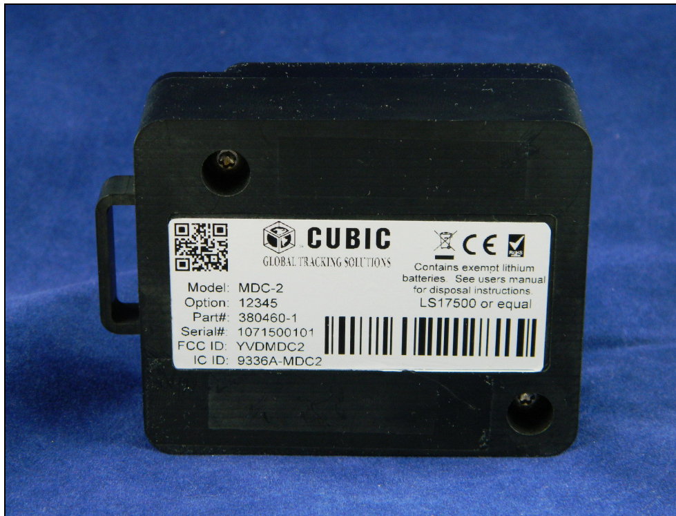
Figure 1: External Photo