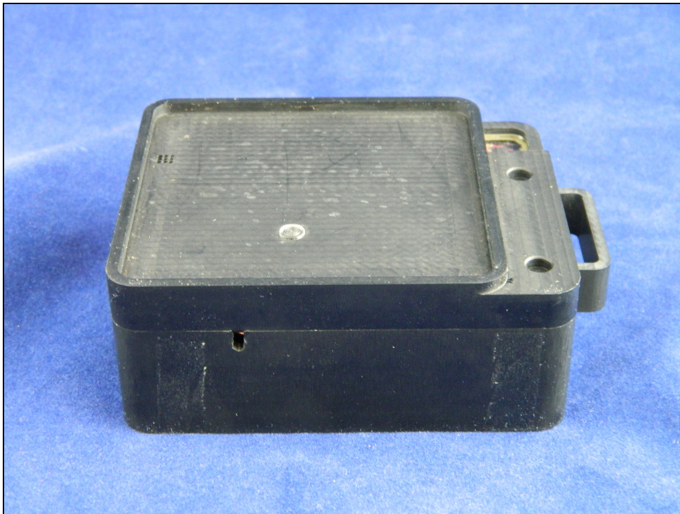
Figure 5: External Photo