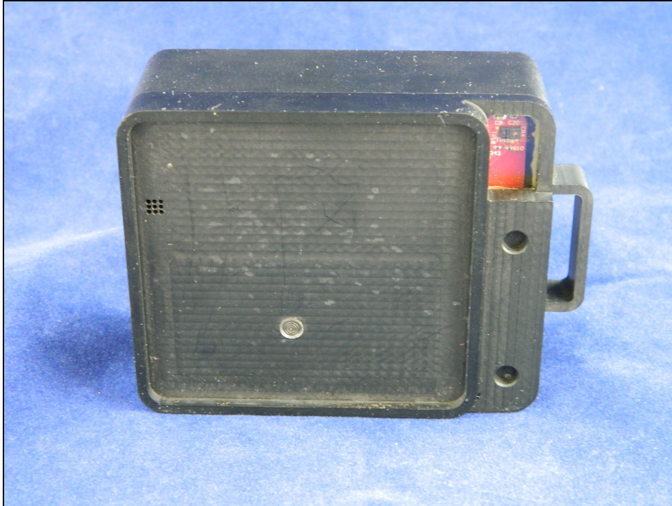
Figure 2: External Photo