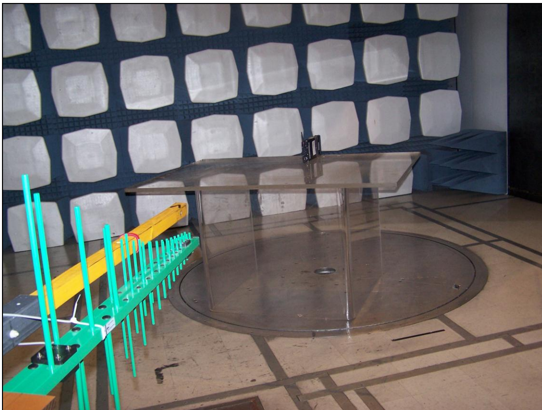
Photograph 2. Radiated Spurious Emissions, Test Setup – 1