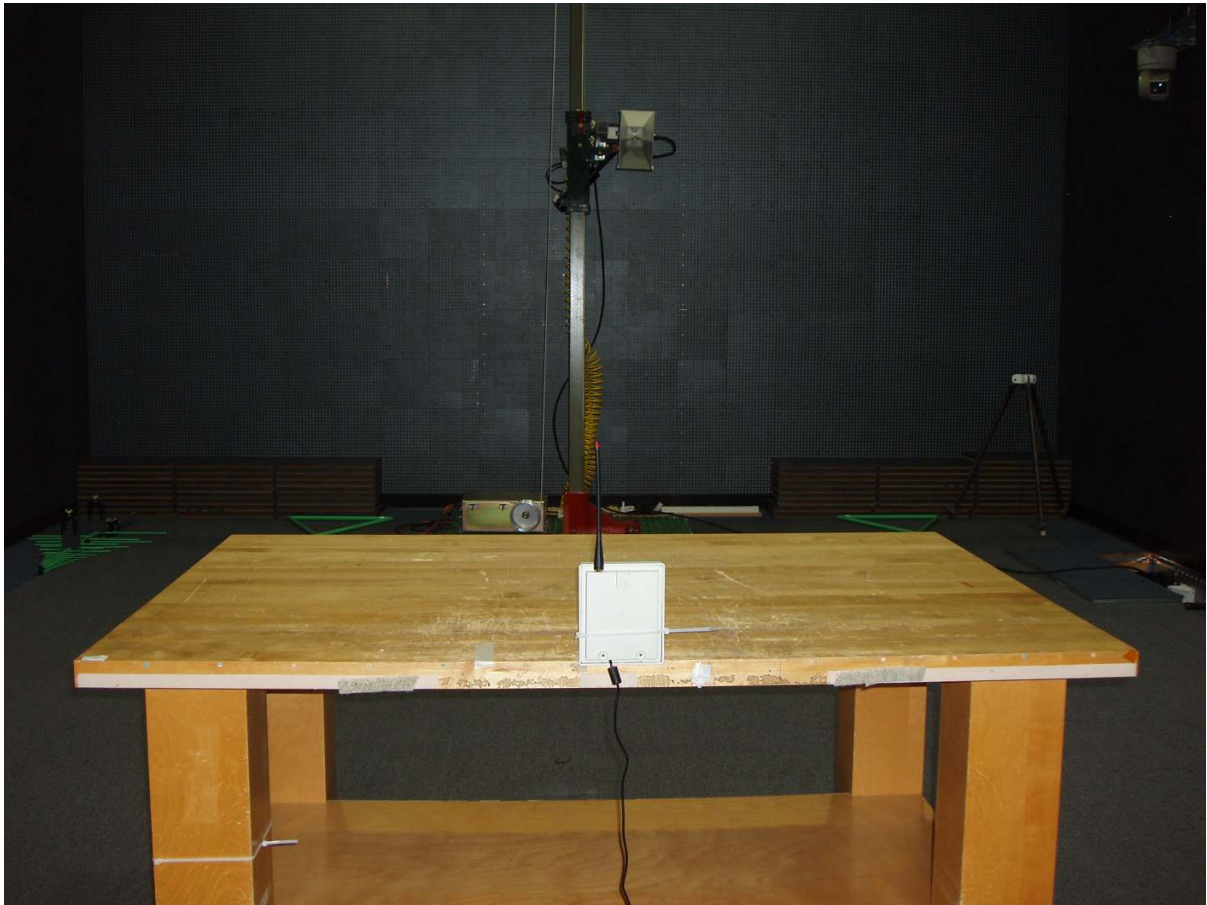
Photo 3 – Rear View of the Radiated Emissions Test Set-up 1 – 10 GHz