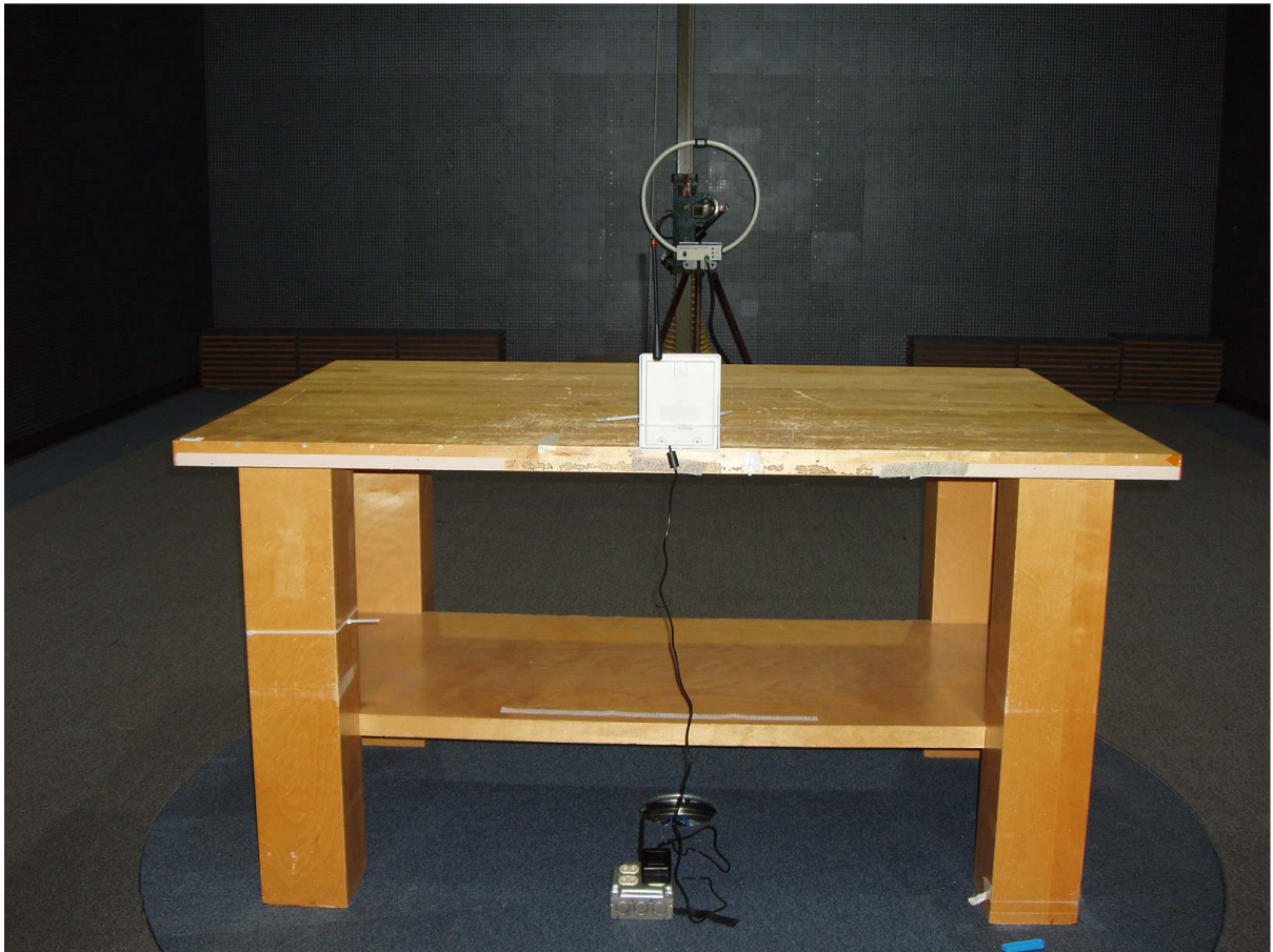
Photo 4 – Rear View of the Radiated Emissions Test Set-up with the Loop Antenna