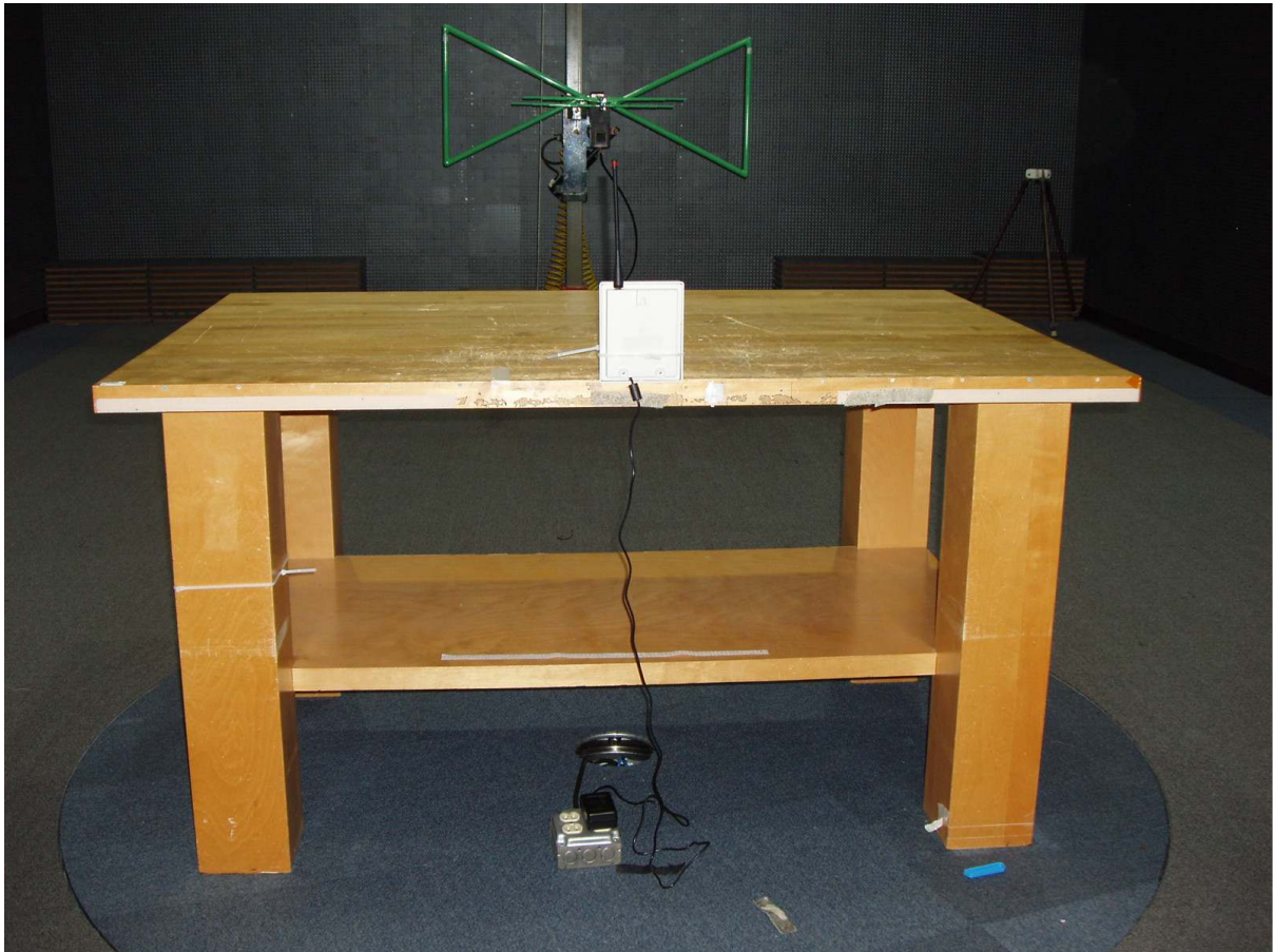
Photo 2 – Rear View of the Radiated Emissions Test Set-up 30 - 1000 MHz