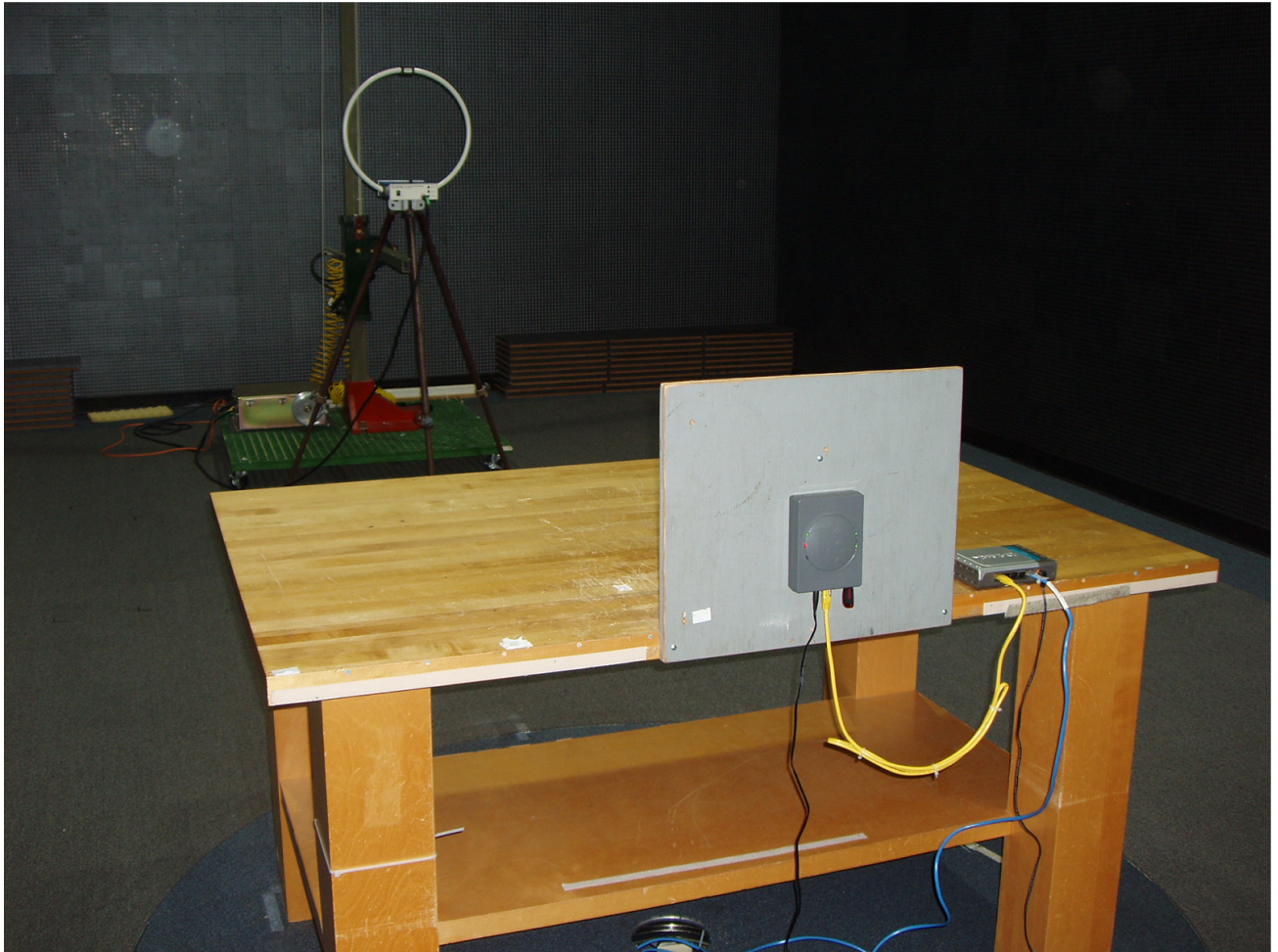
Photo 3 – Rear View of the Radiated Emissions Test Set-up with the Loop Antenna