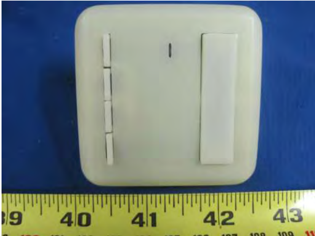
EUT – Front View