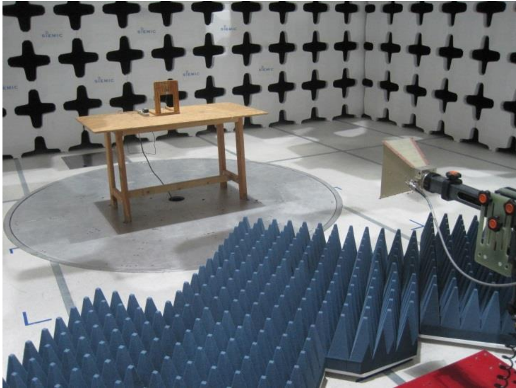
Radiated Emission (>1GHz) – Front View