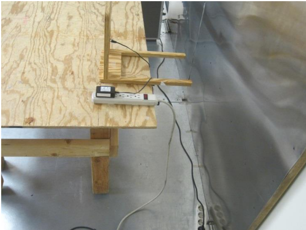
Conducted Emission – Rear View