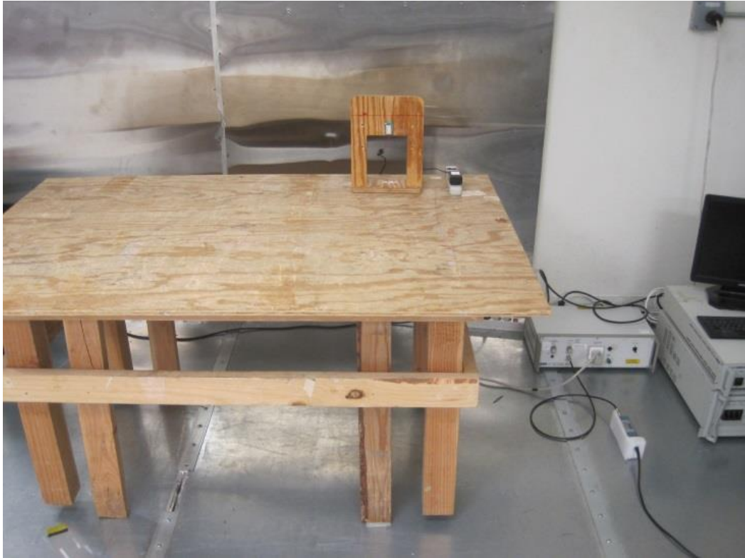
Conducted Emission – Front View