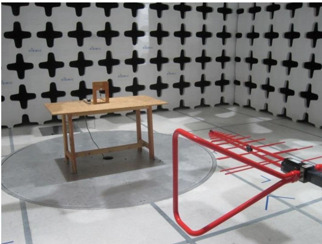
Radiated Emission (<1GHz) – Front View