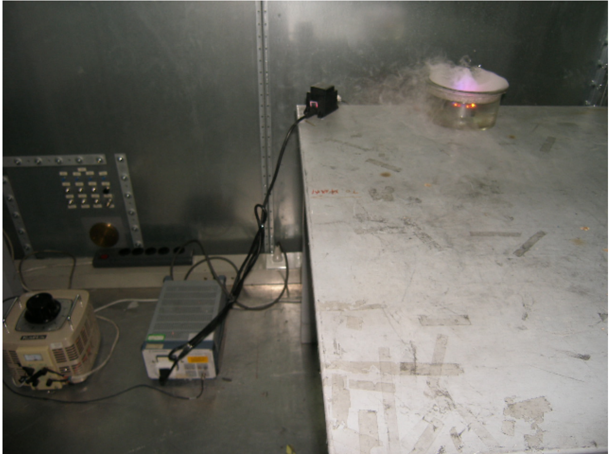
Photograph 1: Set-up for Conducted Emission