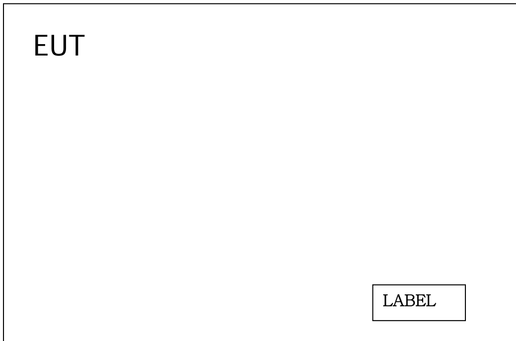
Figure 1.2 LABEL LOCATION

The label shown shall be permanently affixed at a conspicuous location on the device and be readily visible to the user at the time purchase.(Labeling requirements per 2.925)