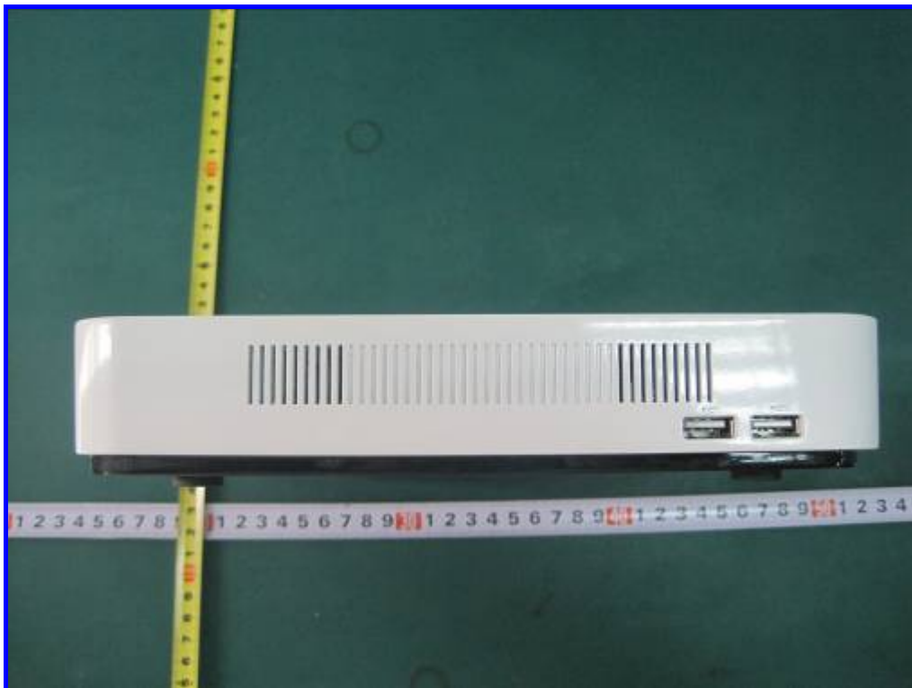
Right View of EUT