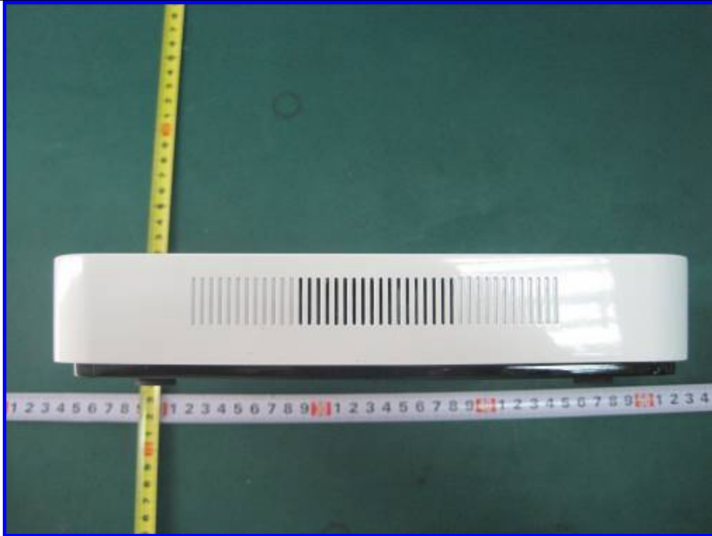
Left View of EUT

Serial#: 1002676 Issue Date: August 16, 2010 Page: 2 of 4 www.siemic.com