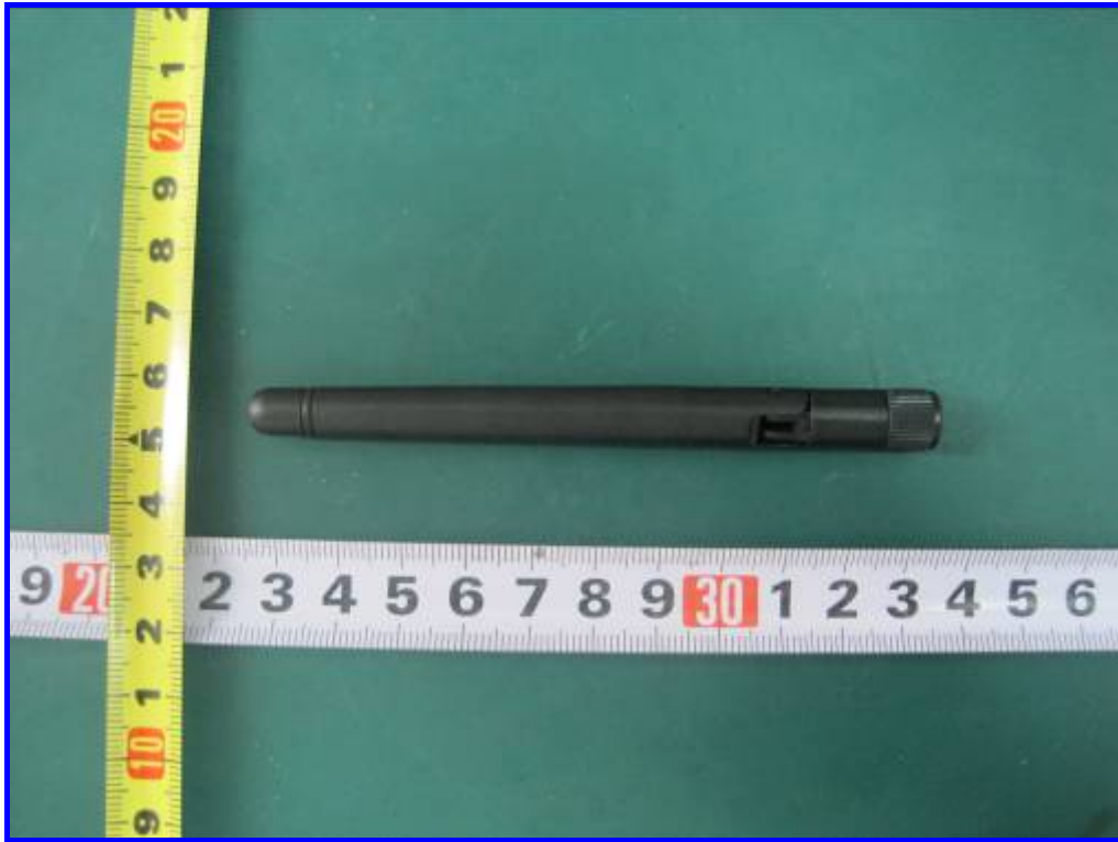
Front view of Antenna