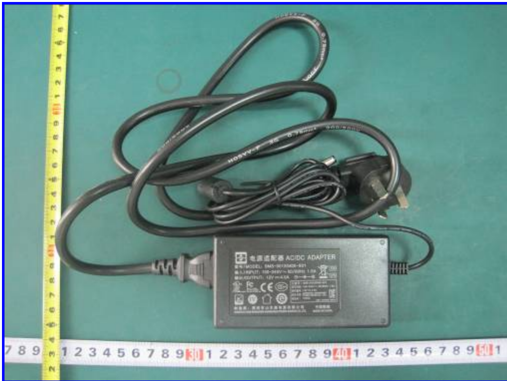
Front view of Power adapter