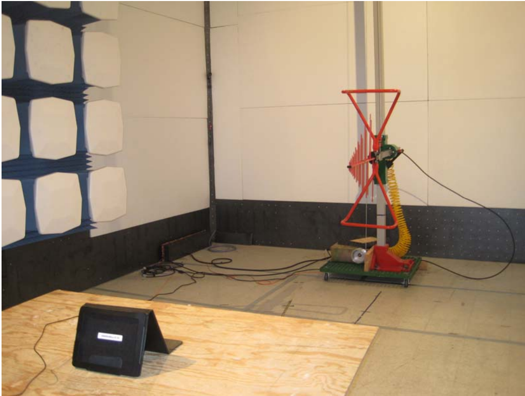
Radiated Emission (30MHz to 1GHz)- Front View