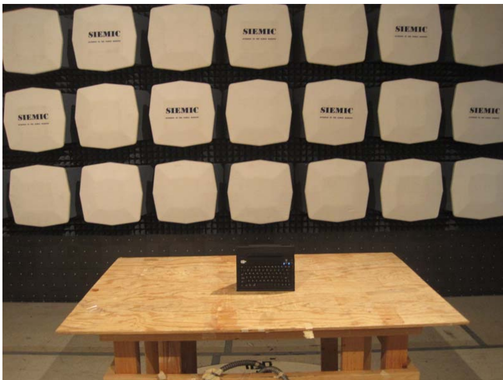
Radiated Emission (above 1GHz)- Front View