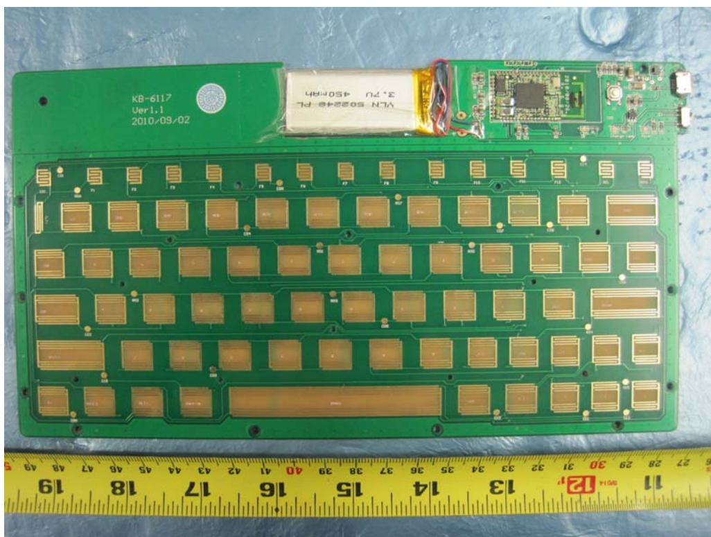
Keyboard Board – Top