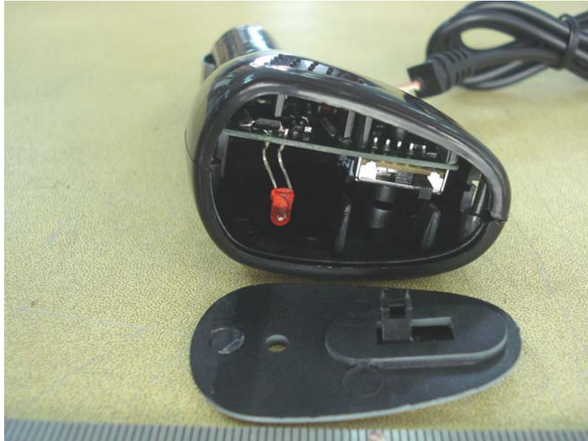
EUT – PCB Front View