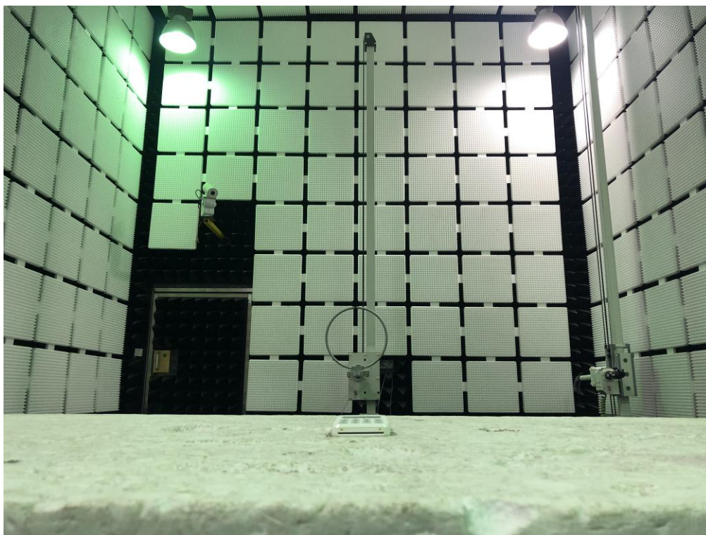
Fig. 1 (Below 30MHz)