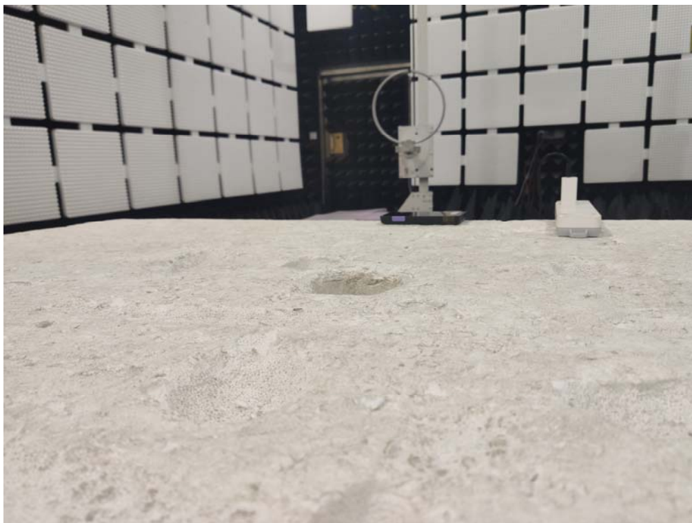
Fig. 1 (Below 30MHz)