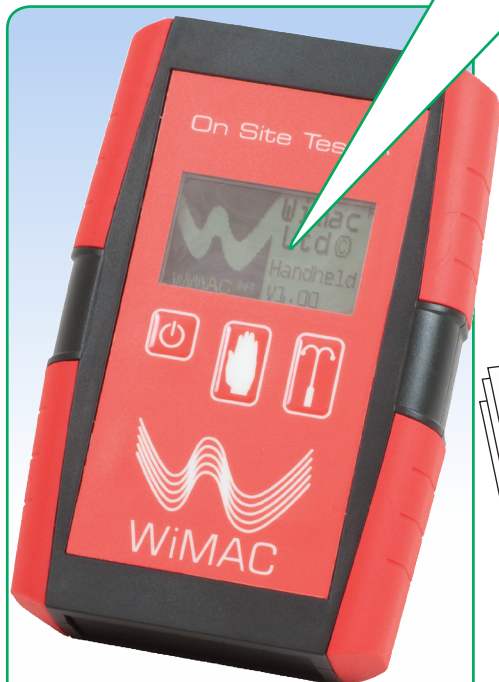
Handheld Node Sniffer