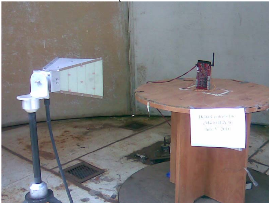
Pic 4: Test Setup for Radiated Emissions