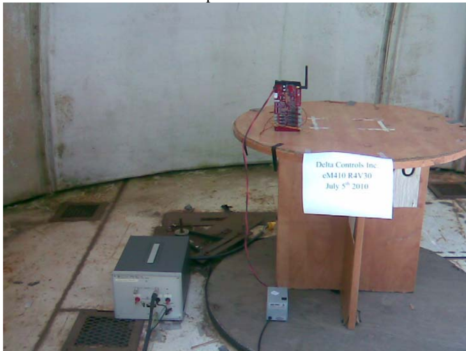
Pic 2 :Test Setup for Conducted Emissions