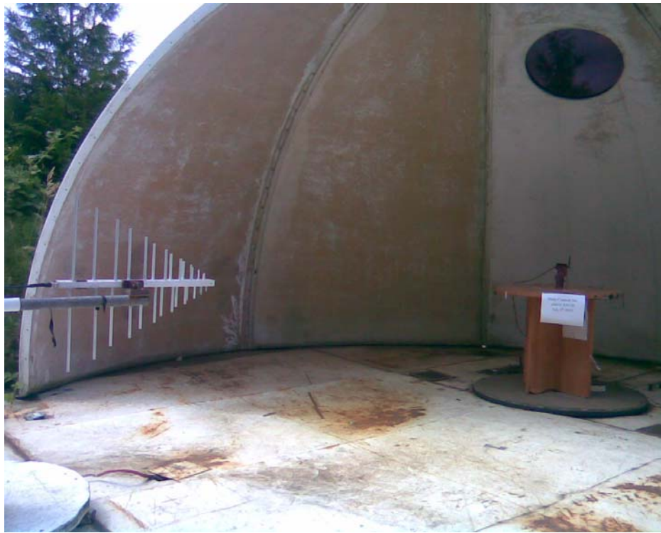
Pic 3: Test Setup for Radiated Emissions