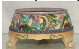
4020794 Princess Sonata Musical Base (Require AA size battery x 3. Battery not included.)

This Musical Base is designed to be used with one of the following figurines at one time. (Figurines are sold separately)