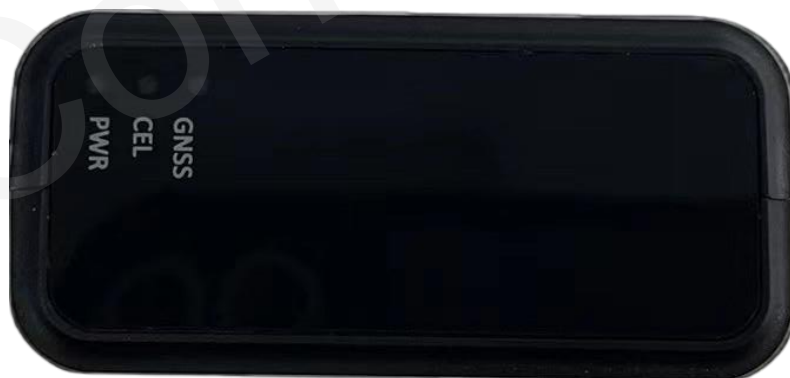
Figure 3: LED Lights of GV500CG

GV500CG has three status LED lights, which are GNSS LED, CEL LED and PWR LED.