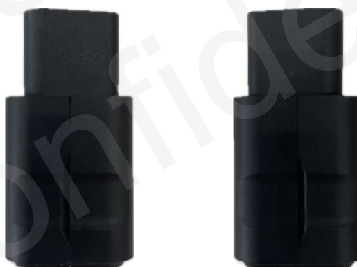
Figure 6: Close the Case

Put the upper cover on the lower cover, and press the covers to make sure they are closed completely.