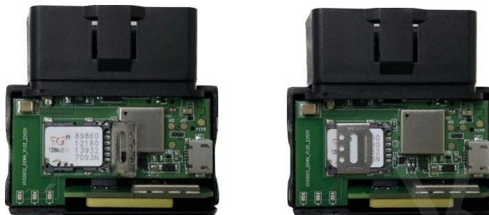
Figure 5: SIM Card Installation

Open the case and ensure the device is not powered. Slide the holder to open the SIM card holder. Insert the SIM card into the holder as shown above with the gold-colored contact area facing down. Take care to align the cut mark. Close the SIM card holder. Close the case.