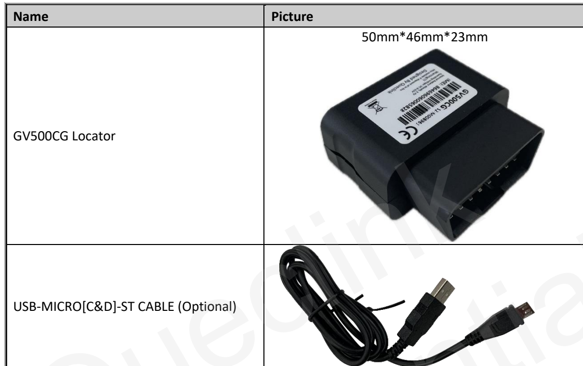
Table 5: Parts List