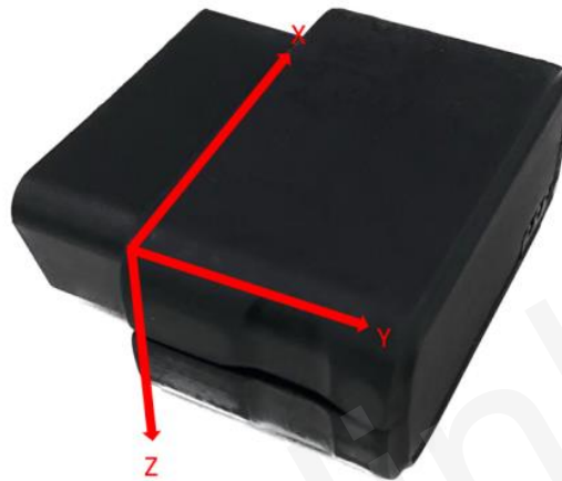
Figure 7: Motion Sensor Direction

GV500CG has an internal 3-axis accelerometer supporting driving behavior monitoring, crash detection and motion detection. The following figure shows the directions of the motion sensor.