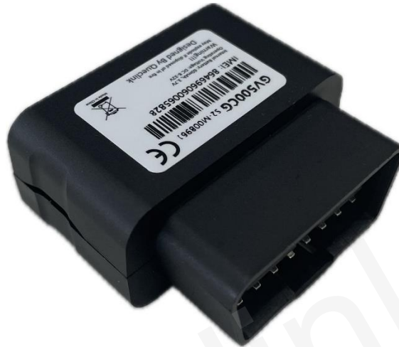
Figure 1: Appearance of GV500CG