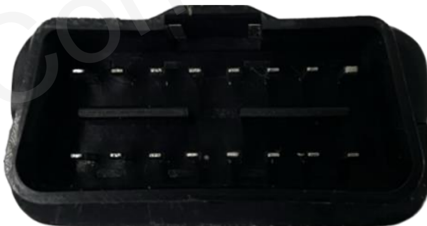
Figure 2: OBD PIN Definition of GV500CG

GV500CG has an OBD II connector, which is used for device external power supply. The order and definition of the OBD II connector are shown below: