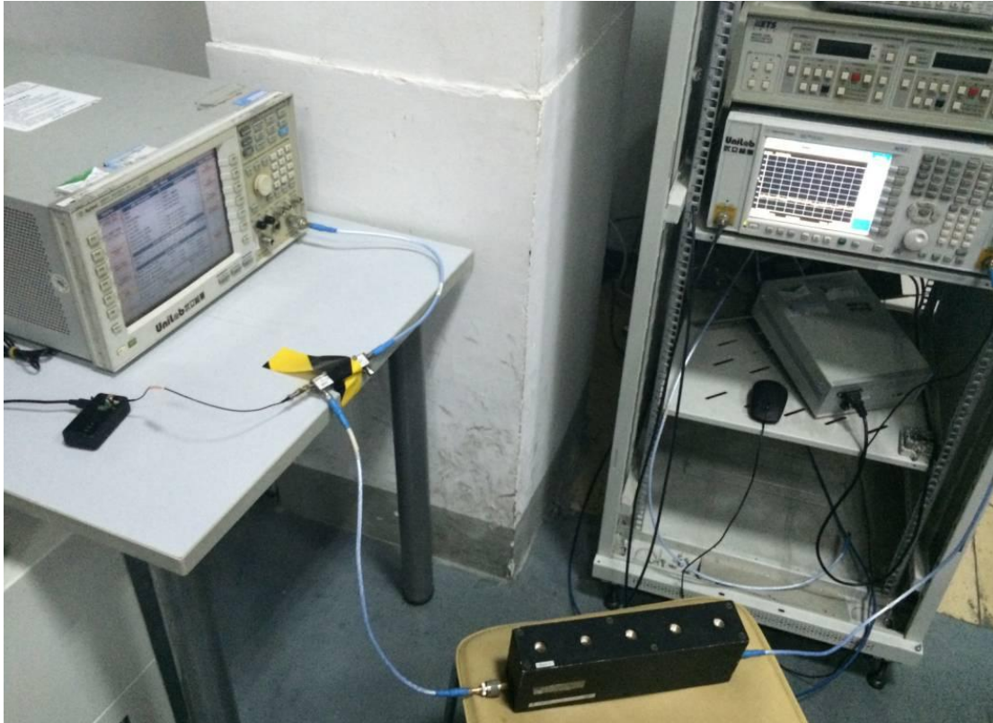
Frequency Stability Under Temperature & Voltage Variations Setup