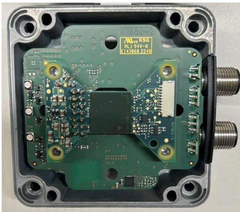
Photograph 3: EUT 1_Inside view 3