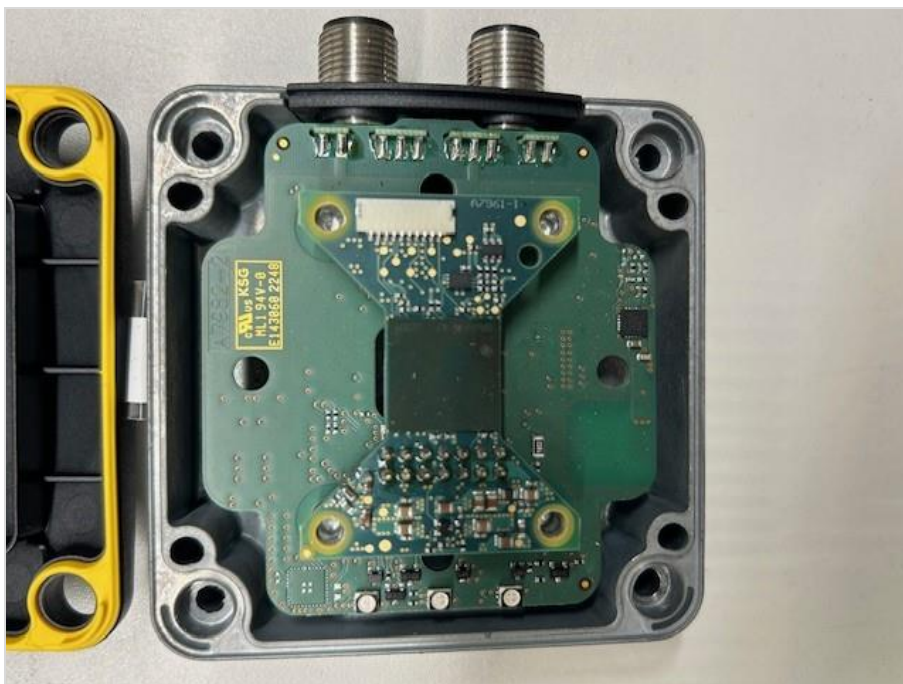
Photograph 2: EUT 1_Inside view 2