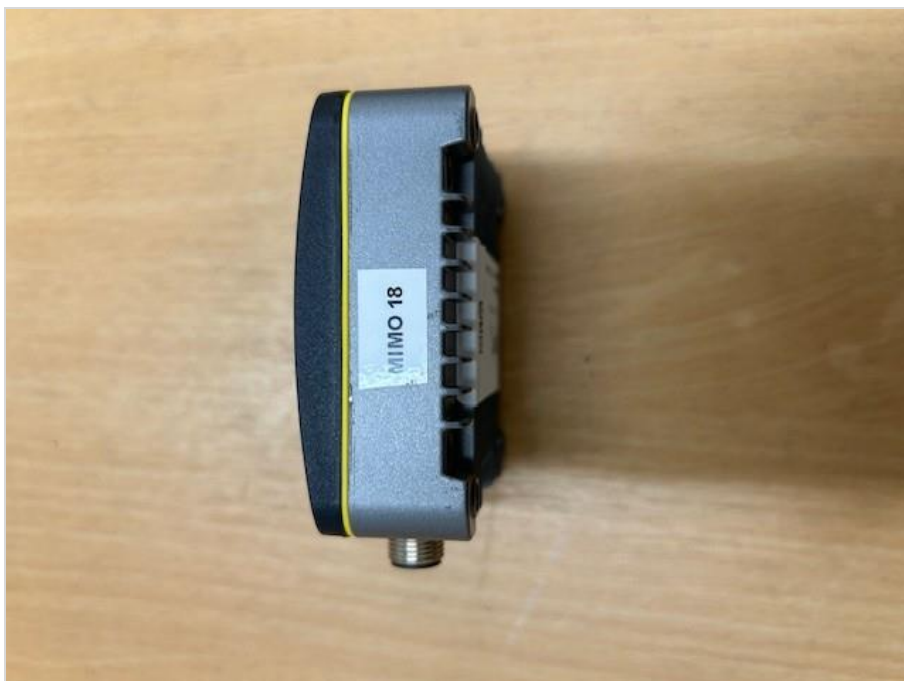
Photograph 4: EUT right side in respect to measurement