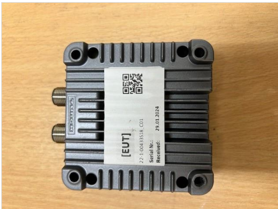
Photograph 2: EUT rear side in respect to measurement