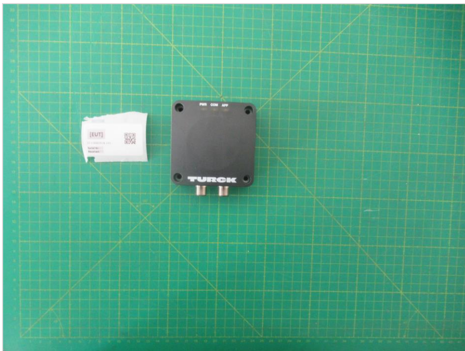
Photograph 1: EUT front side in respect to measurement