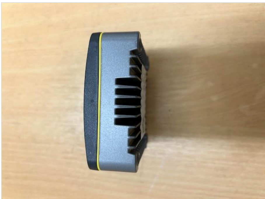
Photograph 5: EUT top side in respect to measurement