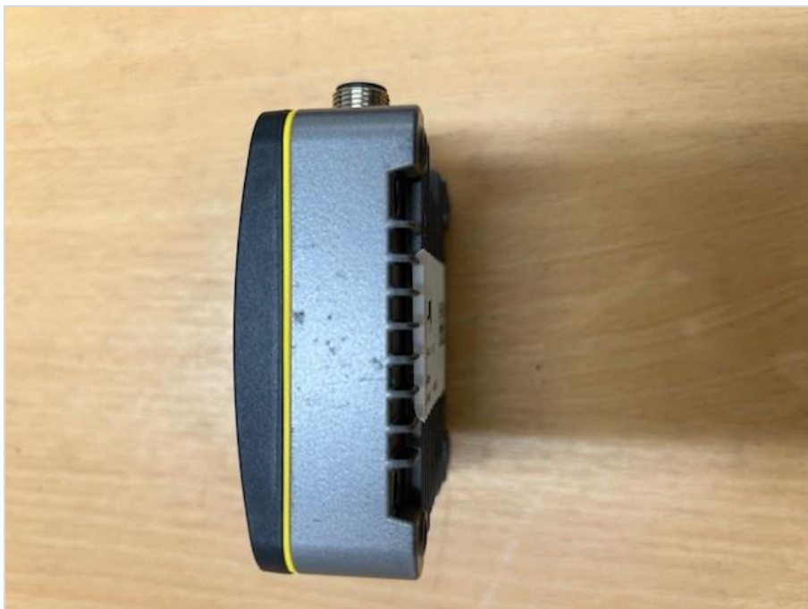
Photograph 3: EUT left side in respect to measurement