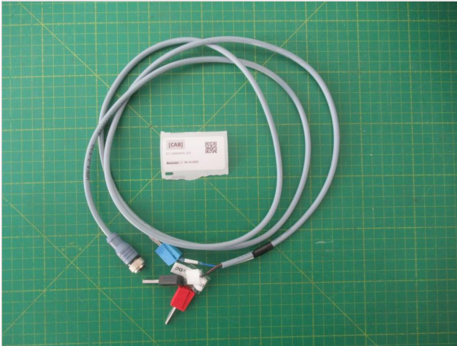
Photograph 7: CAB 1