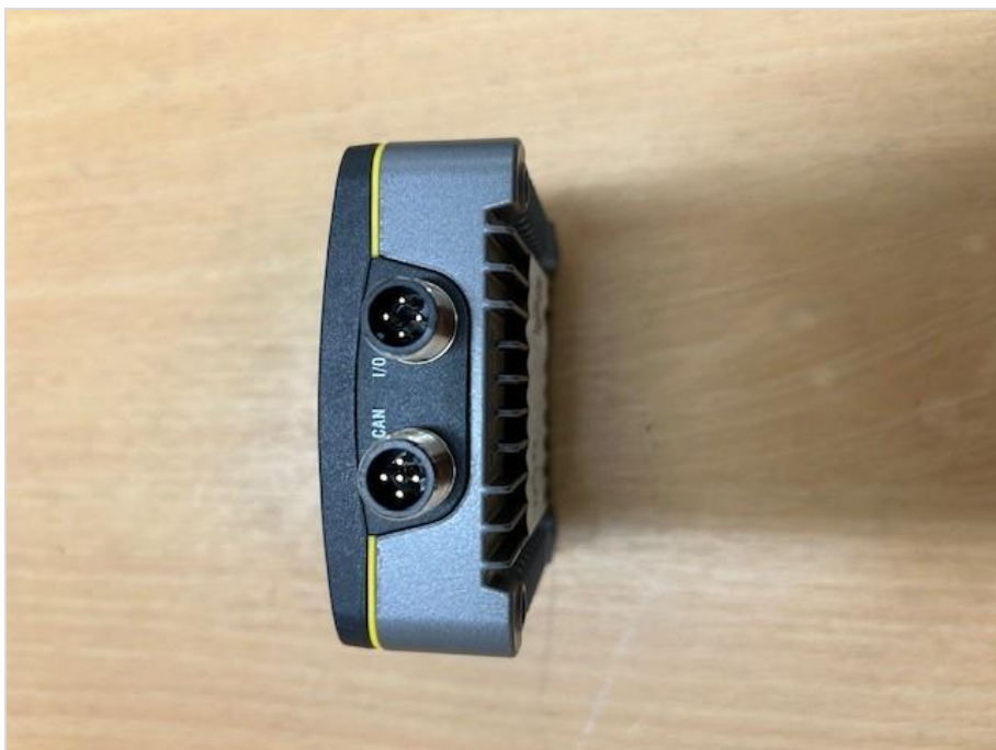
Photograph 6: EUT bottom side in respect to measurement