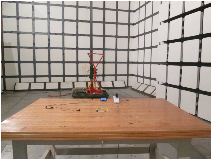
Radiated Emissions – Rear View (30-1000 MHz)