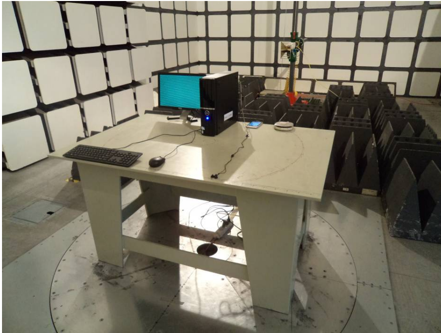
Radiated Emissions – Rear View (Above 1 GHz)