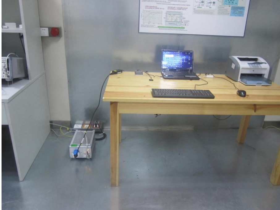
JBP radiation L