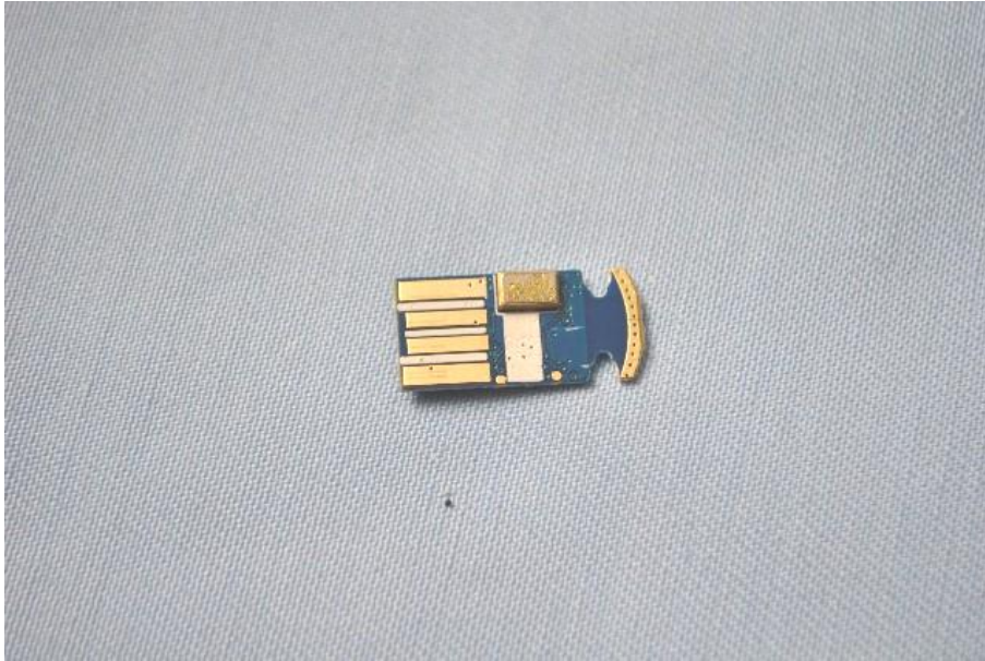
Main&RF board solder side