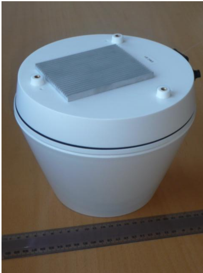
7signal Sapphire Eye