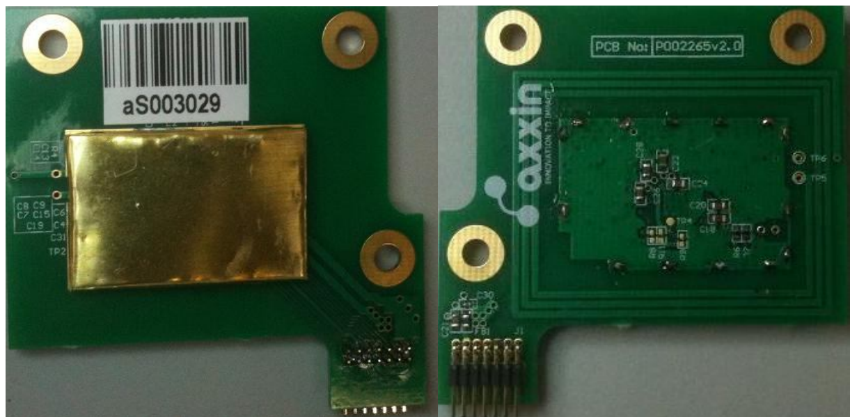
Axxin Kinetic RFID Reader front and rear view

Please note that the module is designed and meant to be used as a standard configuration of TRF7960 silicon based 'RFID Front End' and therefore it's not the purpose of this manual to provide a fully comprehensive description of module functionality and features as they are included in TRF7960 silicon related documentation, which should be used for the purpose of module integration into equipment.