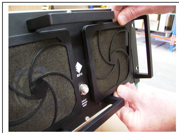
Figure 28 – Fan cover removal

Both front mounted cooling fans have removable dust filters, which will require periodic cleaning. These filters are accessible from the front of the DSPbR by carefully levering off the plastic fan covers by hand.