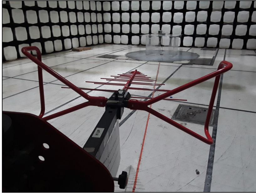
Photograph 1. Radiated Spurious Emissions, Below 1 GHz, Test Setup