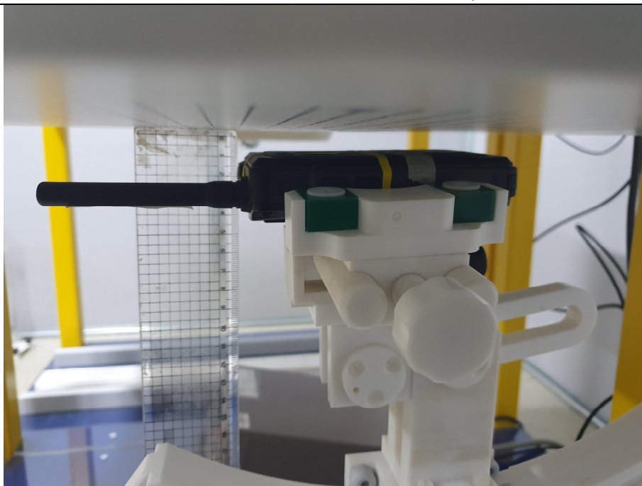
Front of Device 10 mm from Phantom Side view