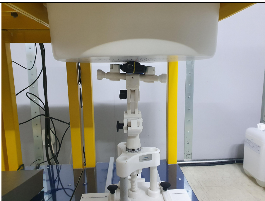
Rear of Device 0 mm from Phantom Top view