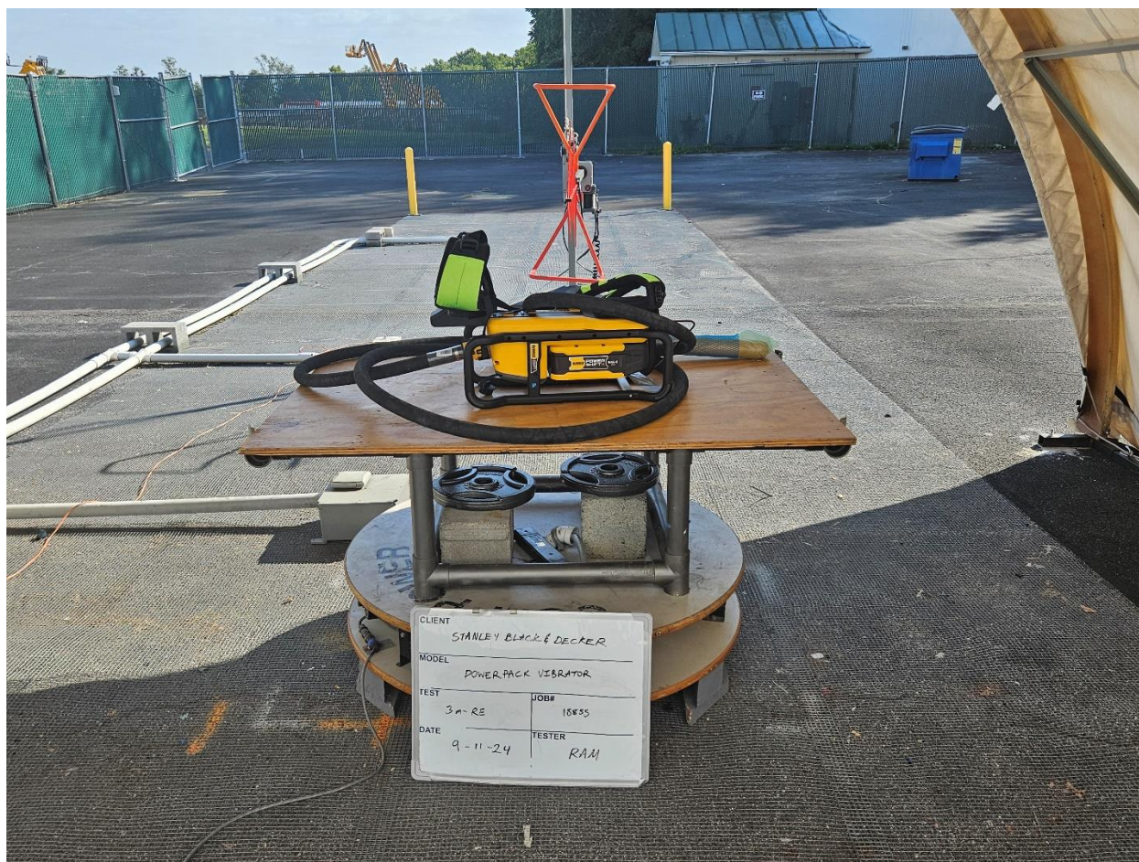
Radiated Emissions, < 1GHz