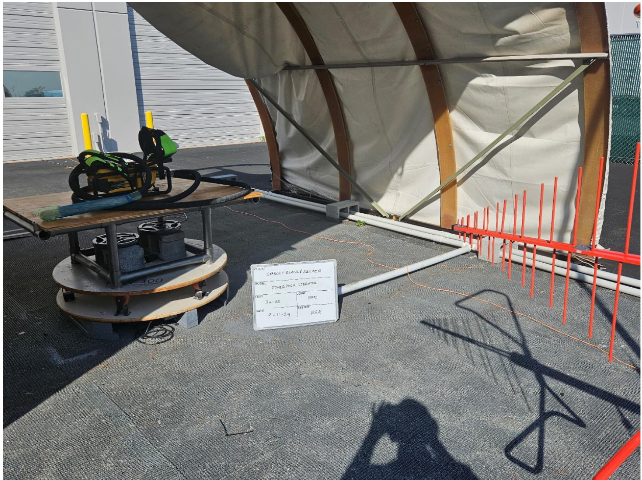
Radiated Emissions, < 1GHz