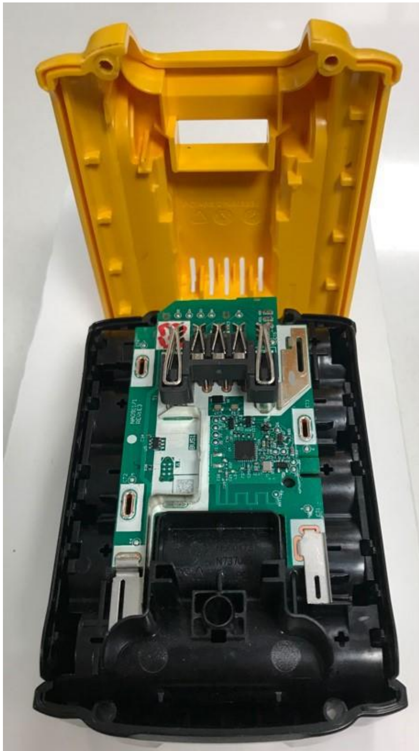
Inside Front View