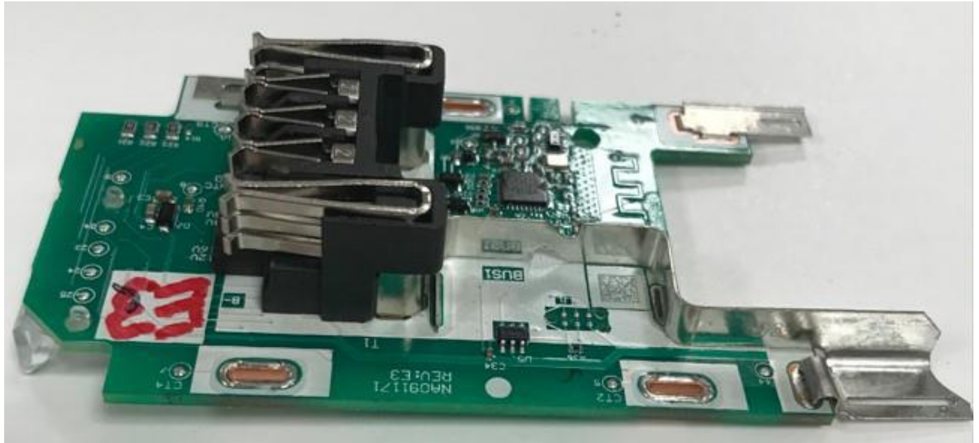
PCBA Side View