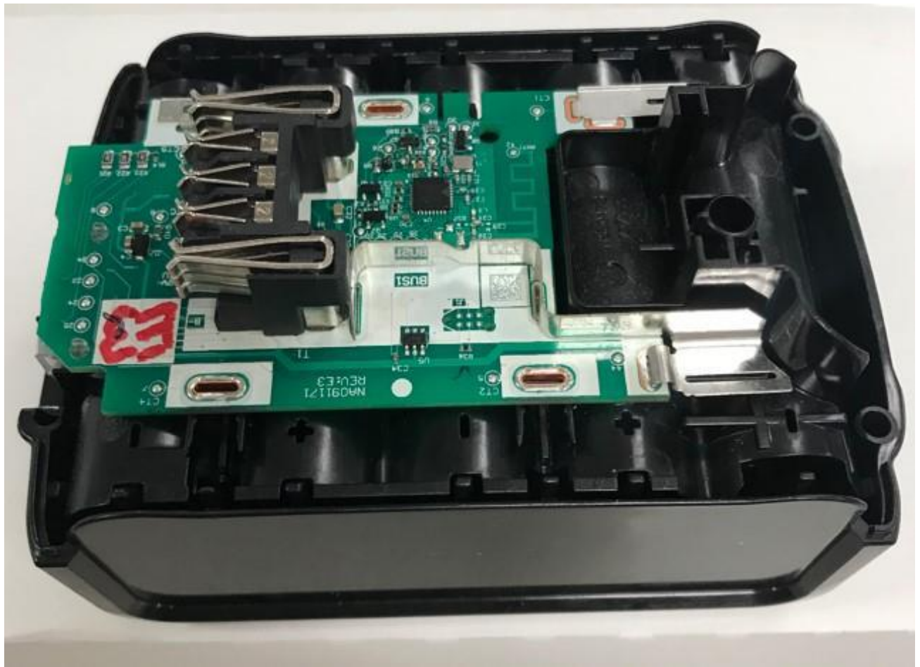
Inside Side View