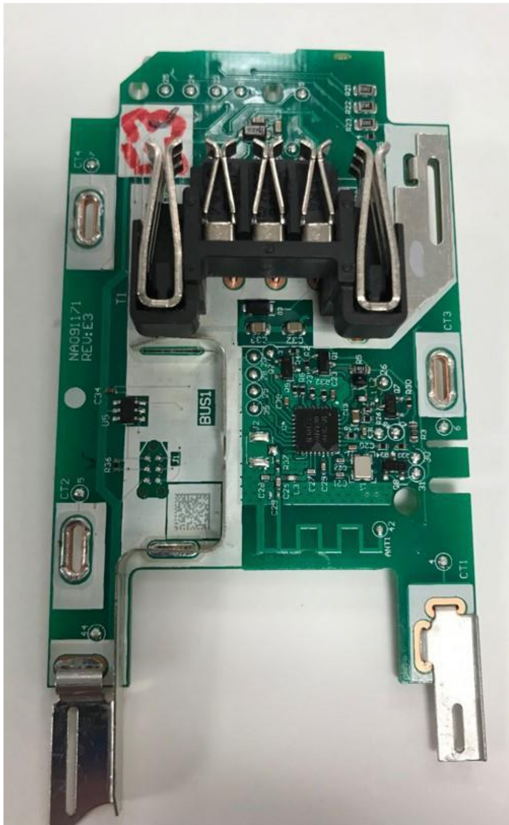
PCBA Top View