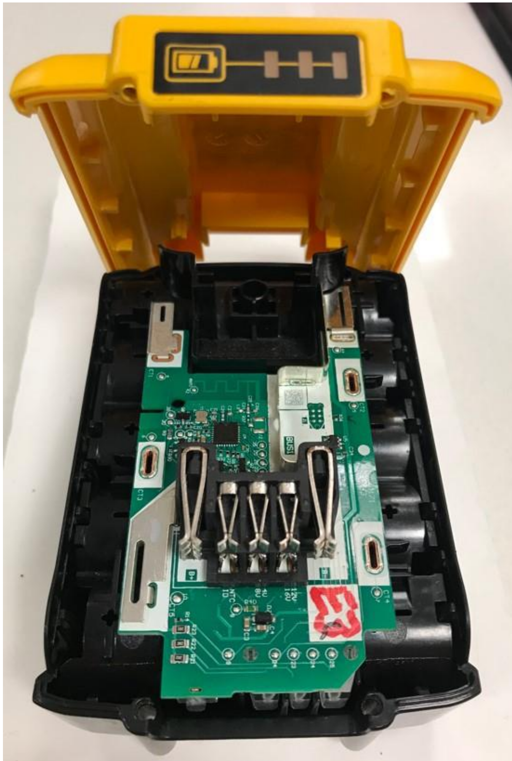
Inside Back View