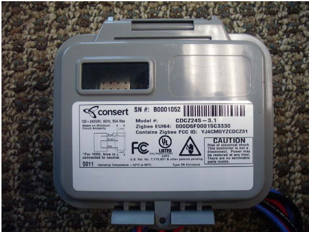
Figure 3: Label Location as see on a Device Controller without relay