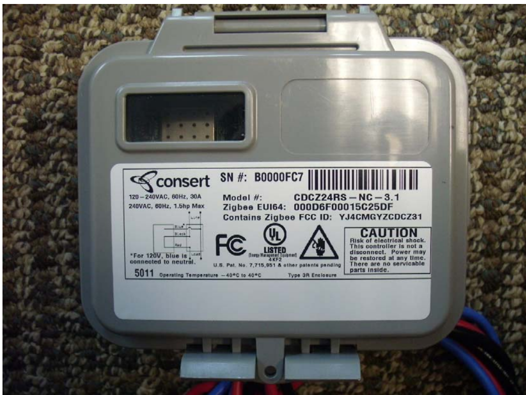
Figure 4: Label Location as see on a Device Controller with relay