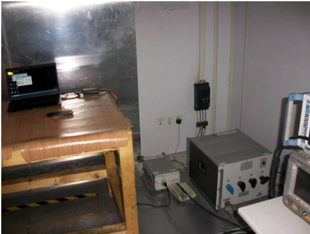
Test photo of radiated emission (30MHz-1000MHz)