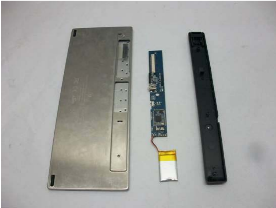
INTERNAL PHOTO OF TX – 2