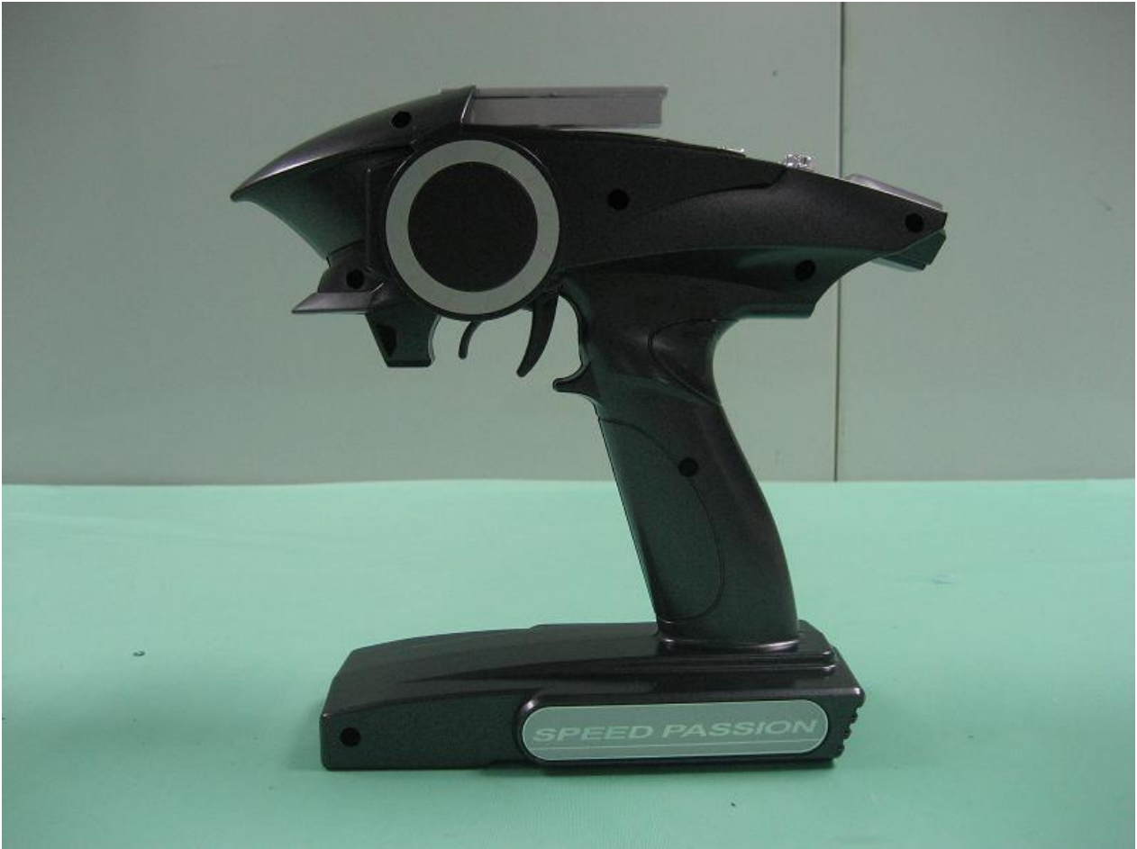
PHOTOGRAPH OF THE PRODUCT REAR VIEW OF THE PRODUCT