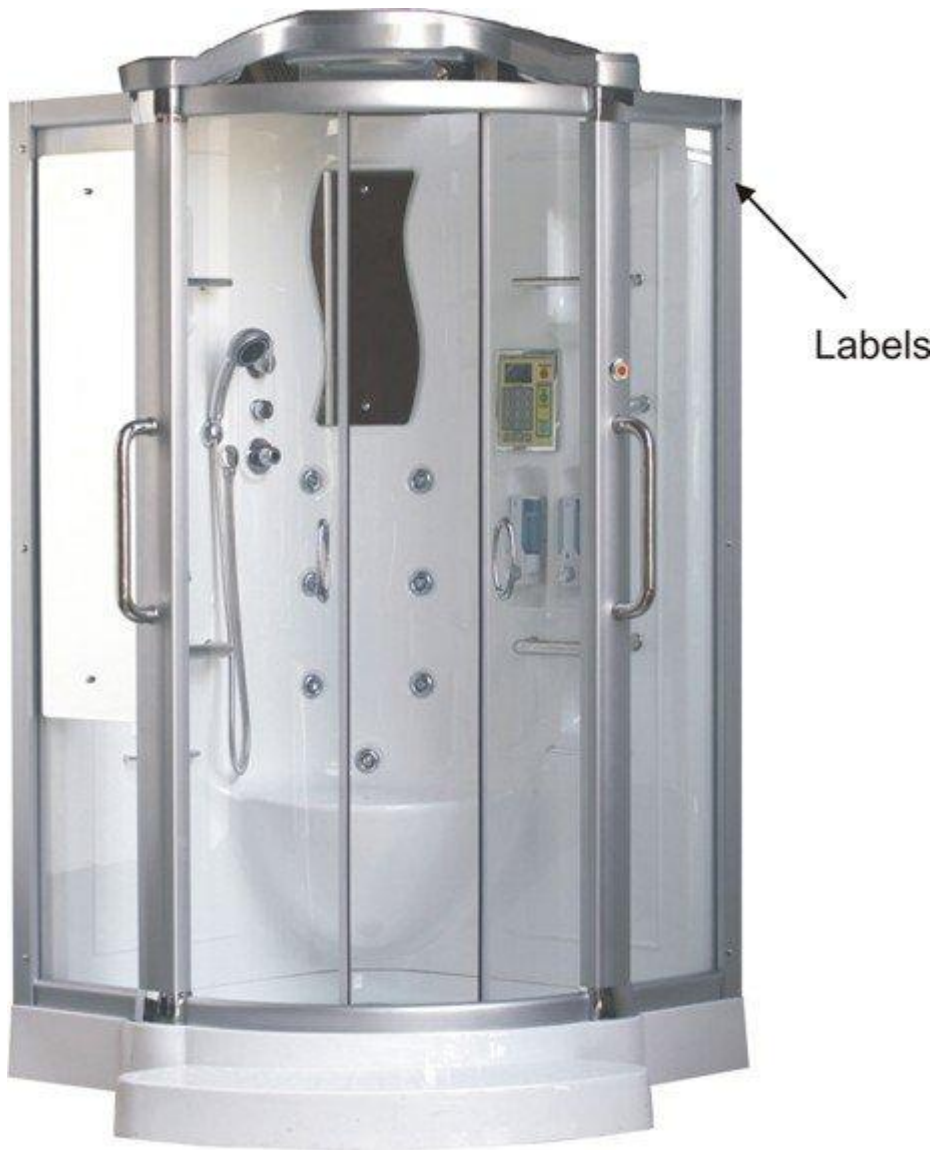
Label Placement on Shower