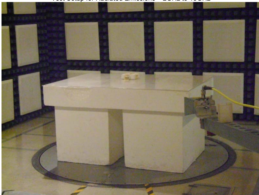
Test Setup for Radiated Emissions – 2GHz to 18GHz