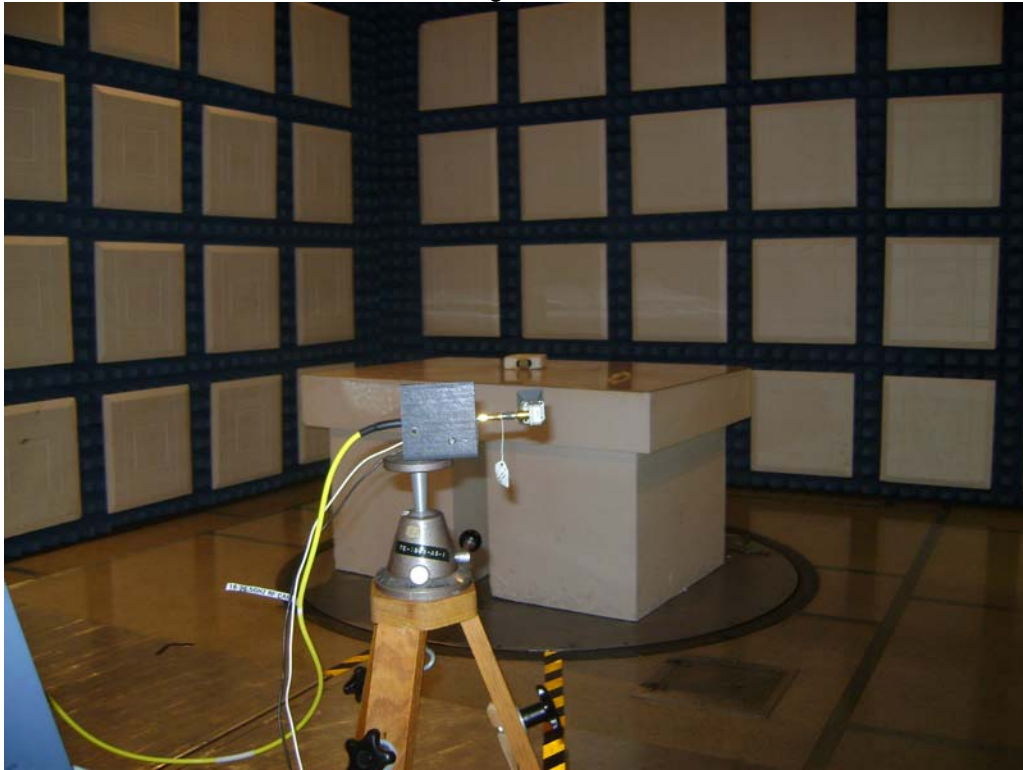
Test Setup for Radiated Emissions – 18GHz to 25GHz, Horizontal Polarization