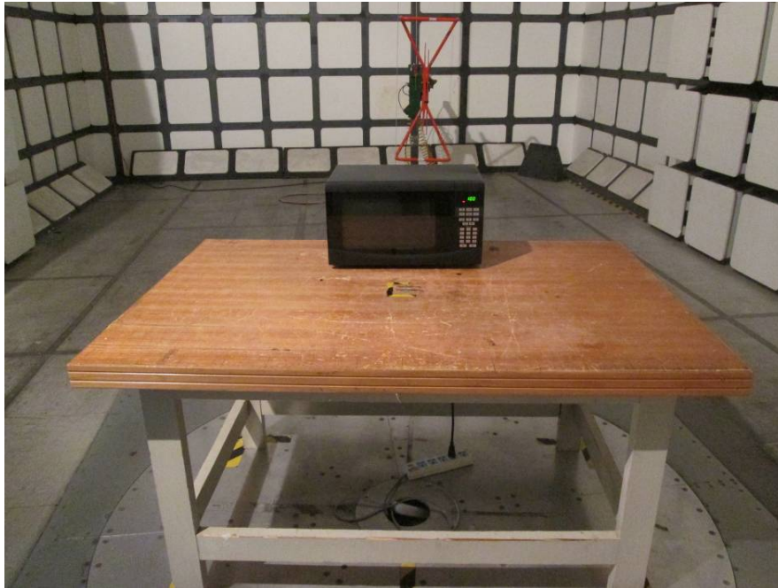
Radiated Emissions – Rear View (30 MHz – 1 GHz)