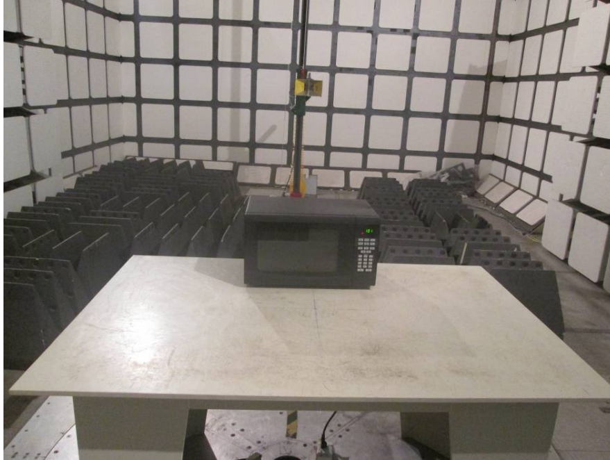
Radiated Emissions - Rear View (Above 1 GHz)